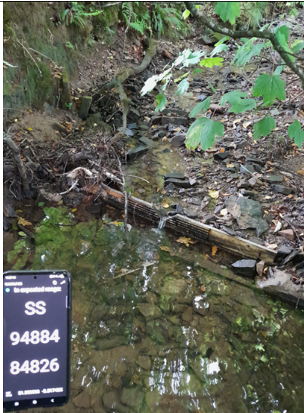
Photograph 2: Gateboard Location