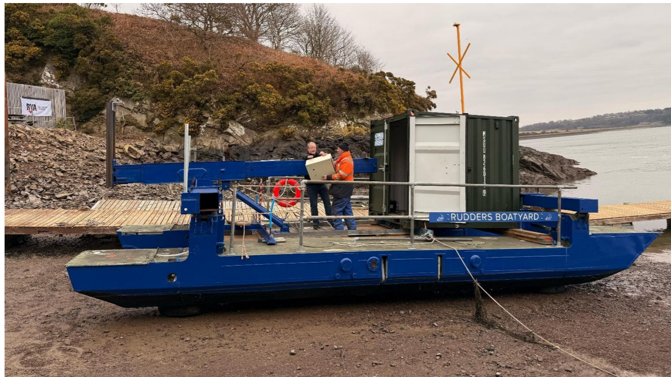
Figure 2 Picture of the 10m x 6m test barge.