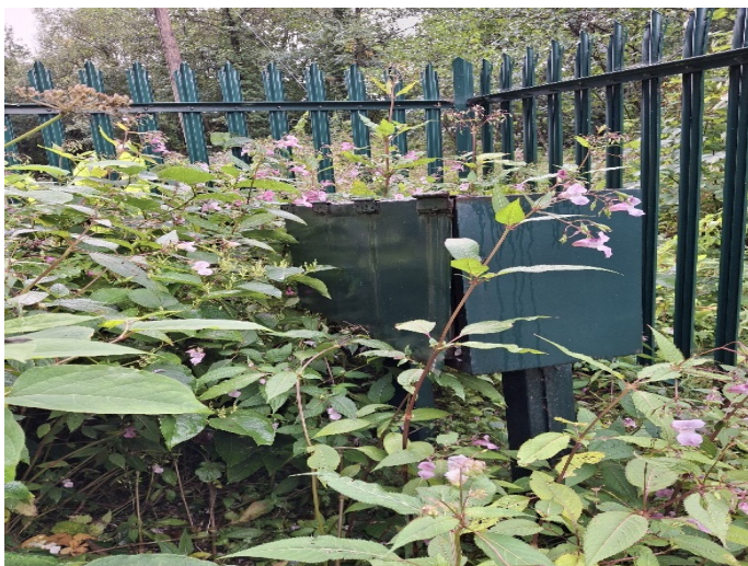
Figure 1: Exterior of flow monitoring infrastructure

The discharge point was next inspected. This was easily accessible due to the vegetation being cleared recently. The permit specifies that the discharge is made via 'outlet 1'. However, despite going to the exact grid reference provided in the permit, no discharge, outlet or associated pipework could be found. This requires further investigation by the council; it could be that the grid reference for the discharge is incorrect, or that the infrastructure is buried but this could not be determined while on site.