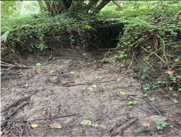
Figure 2: Precise location of the discharge point in the permit