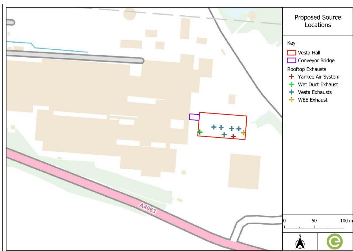
Figure 2: Modelled Activity Locations