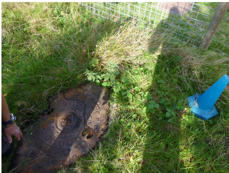
Photograph 1: Septic tank

Sewage at Plas Gwyn is treated by a septic tank situated at approximately SN 52720 68379. The septic tank is shown in photograph 1 below. The septic tank is desludged at least once a year.