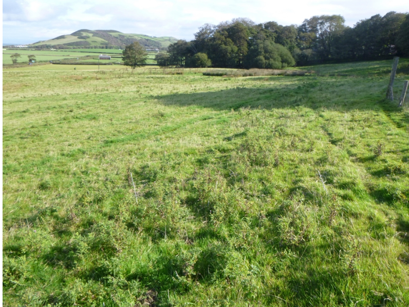
Photograph 3: Drainage field

Condition 2.2.1 of permit BP0143201 states that the discharge shall be made at SN 52740 68350. This grid reference matches the grid reference of the residential home rather than the septic tank's specific discharge location as depicted in figure 1 below. This is not considered a breach of permit, but rather an administrative error. It is recommended that when permit BP0143201 is next varied (such as when amending Tilmala Healthcare Ltd's registered office address as described below), the grid reference for the discharge point and effluent sample point are amended to improve accuracy.