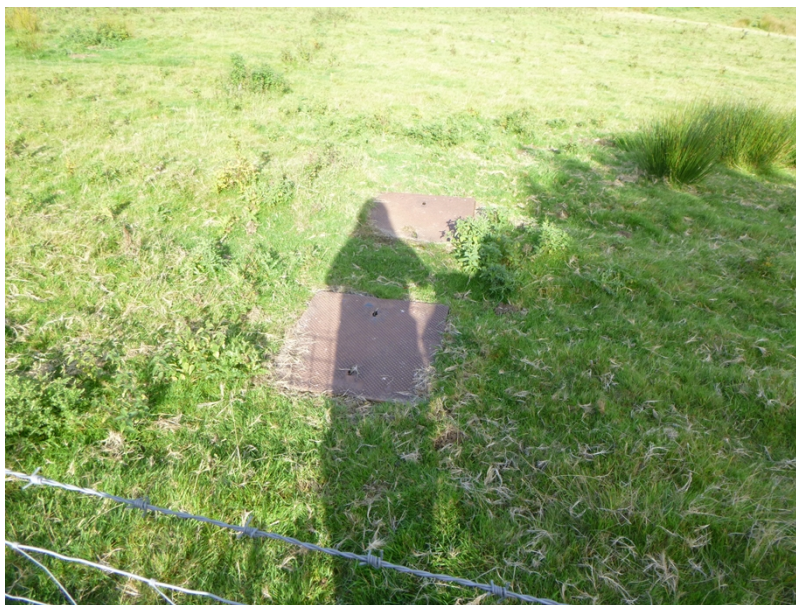
Photograph 2: Effluent sample point

had been made to open the effluent sample point, however the cover could not be lifted. It was therefore not possible to inspect effluent at the effluent sample point at the time of the inspection. This is a breach of condition 3.3.1 of permit BP0143201 which states that " permanent means of access shall be provided to enable sampling/monitoring to be carried out in relation to the emission points specified in schedule 3 ". A category 3 non-compliance has therefore been recorded above for a non-compliance that has the potential to have a minor or minimal impact or effect on the environment, people and/or property. To rectify this non-compliance, the permit holder, Tilmala Healthcare Ltd, are asked to carry out works to enable the effluent sample point to be opened. Tilmala Healthcare Ltd are asked to provide a photograph of the inside of the effluent sample point as evidence that this has been completed by the 05 February 2026 .