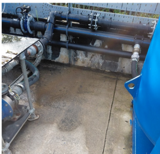
Photo 1. Example of the good housekeeping, completely free from litter and debris.

Officers ROSSITER and CURTIS were shown around the site after receiving a site induction. The Site Supervisor gave a detailed account of how the site works and the processes behind it. Due to the nature of the site many of the failsafe to stop environmental damage are automated and sensor related. On walking around the site, it was observed that the flooring and the concrete bunded wall were well maintained and the housekeeping was extremely good, as shown in photo 1. No standing water was observed.