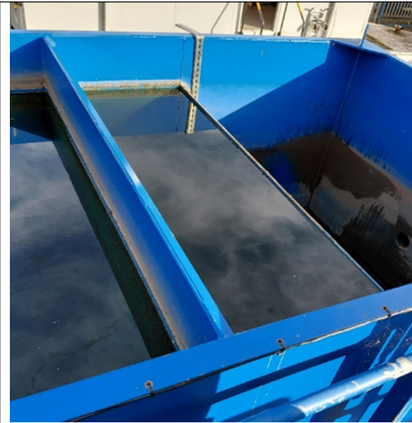
Photo 2. Recently replaced tank.

The Site Supervisor has a very good understanding of the sites permit and obligations surrounding it. Said permit was on display in the site office, as shown in photo 3, and the Site Supervisor knew of the recent variation that had taken place.