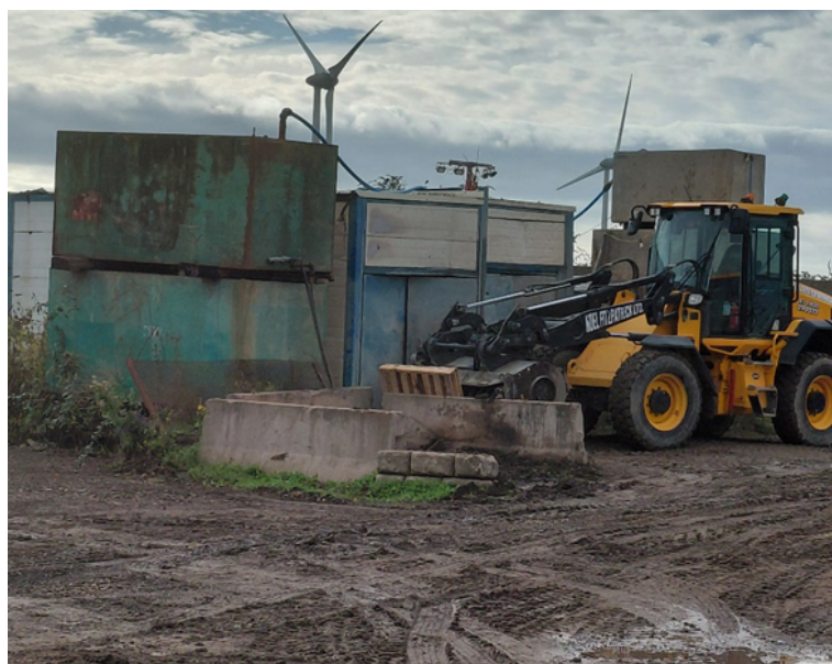
Photo 3. Tanks for water storage used for dust suppression.