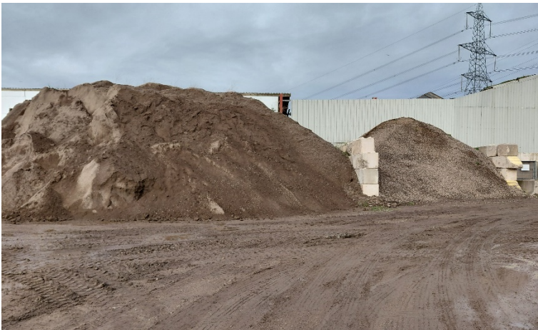
Photo 1. Clean, well-maintained site with product in defined bays.