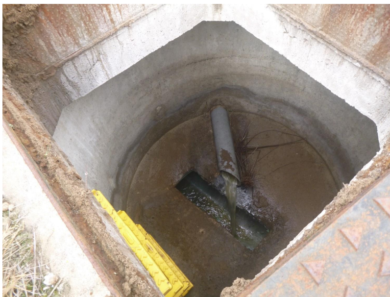
Photograph 2: Final effluent sample point on 26 August 2025. Final effluent appeared discoloured.

Following the NRW officers' visit on the 26 August 2025, Sea Rivers Caravan Park confirmed that they had arranged for the sewage treatment plant to be desludged on the 03 September 2025.