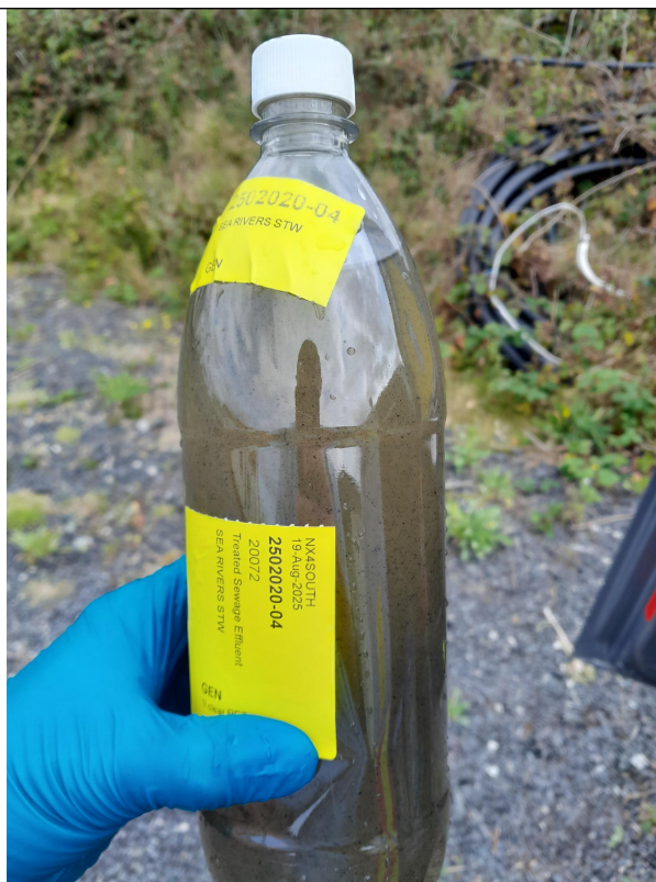
Photograph 1: Final effluent sample collected from Sea Rivers Caravan Park on the 19 August 2025.

Condition 1.6.1 of permit CG0046101 states that final effluent from Sea Rivers Caravan Park's sewage treatment plant must not contain more than 60mg/l BOD and 80mg/l suspended solids. The BOD and suspended solids concentrations of the final effluent sample collected on the 19 August 2025 exceeded these limits. As the BOD failure was less than twice the absolute limit but not within 20% of the absolute limit, a category 3 non-compliance has been recorded above for a non-compliance that has the potential to have a minor or minimal impact or effect on the environment, people and/or property. As the suspended solids failure was more than twice the absolute limit, a category 2 non-compliance has been recorded above for a non-compliance that has the potential to have a significant impact or effect on the environment, people and/or property.