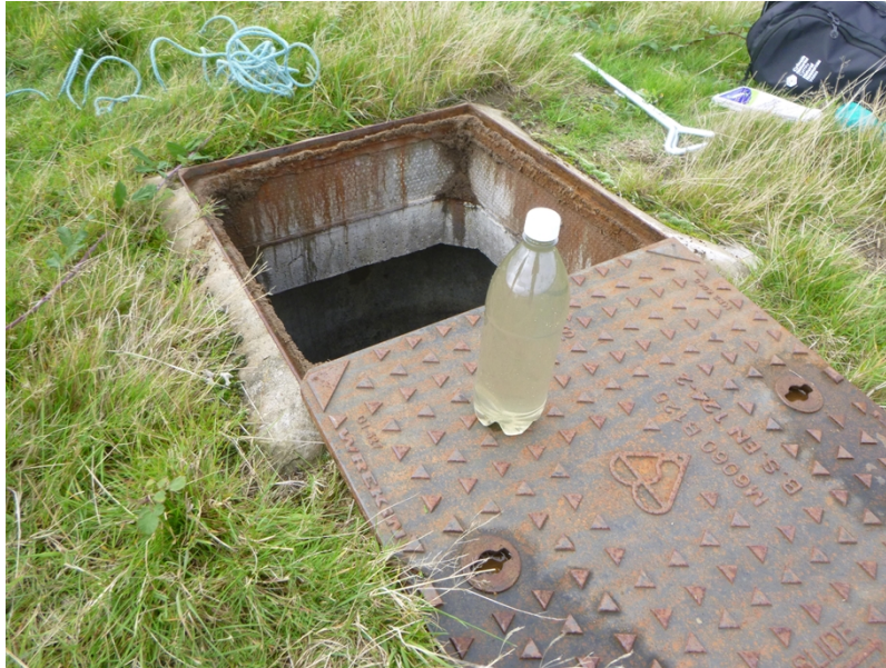
Photograph 4: Formal final effluent sample collected on the 17 September 2025.

As desludging the sewage treatment plant on the 03 September 2025 appears to have rectified the non-compliances recorded above, NRW's enforcement response will amount to a warning only. To avoid repeated sample failures however, the permit holder, Sea Rivers Leisure Sales LTD are asked to regularly desludge the sewage treatment plant in accordance with condition 1.10.1(c) of permit CG0046101 which states that " the sewage treatment plant shall be operated and maintained in accordance with good operational practice such that tanks shall be desludged at sufficient frequency and in such a manner to prevent excessive carryover of suspended solids ". Sea Rivers Leisure Sales LTD are also asked to inspect the final effluent sample point regularly to ensure that the final effluent is free-flowing and clear, and to maintain the sewage treatment plant in accordance with manufacturer's instructions. Although a deadline of the 06 February 2026 has been recorded for these actions above, it is expected that Sea Rivers Leisure Sales LTD continue to undertake these actions whenever the sewage treatment plant is operational.