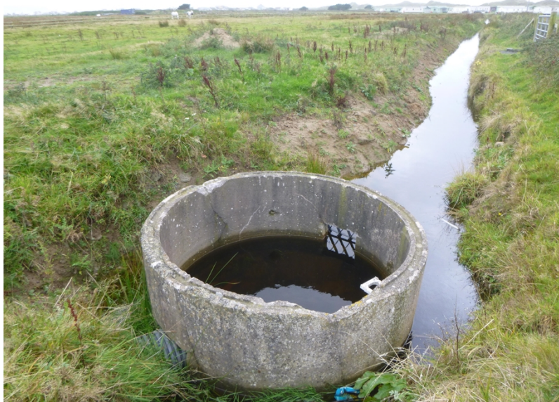
Photograph 5: Ditch near Sea Rivers Caravan Park's final effluent sample point

Within the most recent Compliance Assessment Report (CAR) issued to Sea Rivers Caravan Park on the 20 December 2023 (Report ID: CAR_NRW0042783), Sea Rivers Leisure Sales LTD were asked to "confirm whether water within the newly dug ditch" (as shown in photograph 5 above) "discharges into the final effluent sample point, and if not, confirm where the water discharges". A deadline of the 12 February 2024 had been set for this, however no response was received from Sea Rivers Leisure Sales LTD. NRW therefore again ask Sea Rivers Leisure Sales LTD to confirm whether water within the ditch discharges into the final effluent sample point and to explain why the NRW officers observed final effluent travelling in two different directions within the final effluent sample point on the 26 August and 17 September 2025 respectively. Given that final effluent appeared to travel in two different directions within the final effluent sample point, Sea Rivers Leisure Sales LTD are also asked to confirm how final effluent travels from the final effluent sample point to the permitted discharge point into the Afon Leri at SN 61630 93530. Sea Rivers Leisure Sales LTD are asked to provide a response to the above by no later than the 06 February 2026 .