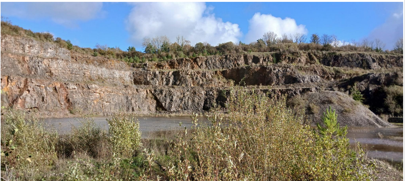
Photo 1 - View of Quarry at Tarmac Hendy site

During the inspection, the overall housekeeping standards across the site were observed to be sufficient. Storage areas were free from unnecessary clutter, waste materials were appropriately stored or disposed of, and walkways remained unobstructed. (see photos 1-2) The on site water pump used to extract water from the base of the quarry was operational with no signs of poor maintenance with the newly installed control system (see photo 3).