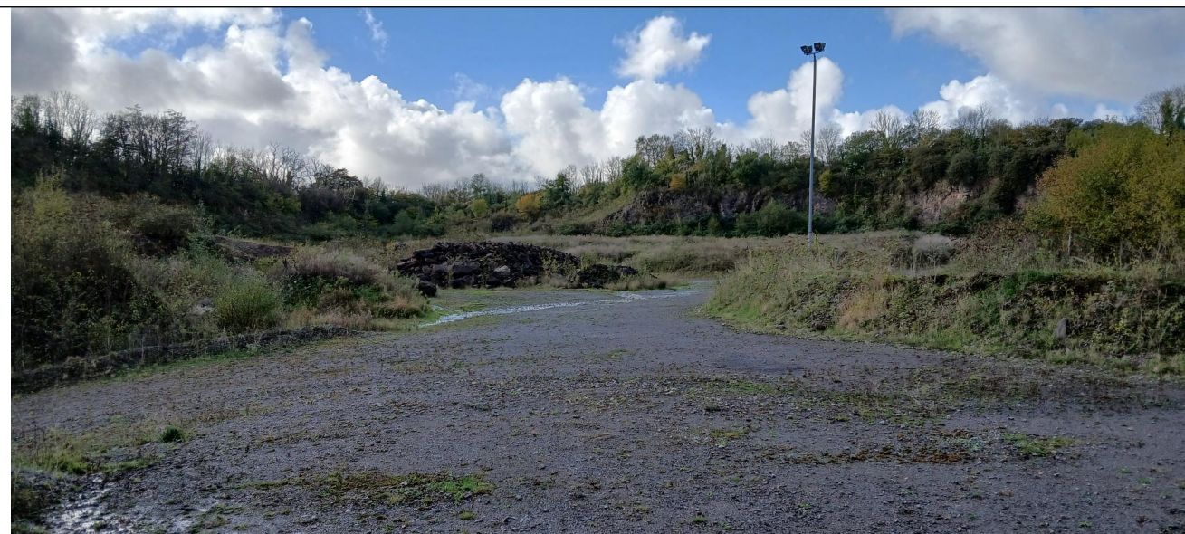
Photo 2 - Old Landfill area currently non-operational at Tarmac Hendy Site