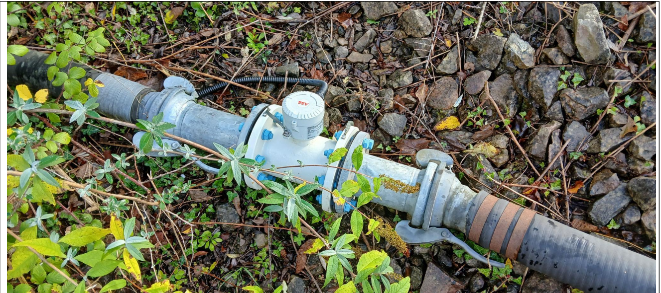
Photo 4 - Flow meter located on surface water discharge pipe at Tarmac Hendy site

On 5 November 2025, Tarmac site management notified Officer GARDNER via email that the monitoring system has been successfully commissioned. Daily readings are now being conducted in accordance with permit conditions, with supporting evidence provided in the form of system screenshots. As such, the action identified in the previous Compliance Assessment Report (CAR_NRW0049033) is considered complete and can be formally closed.