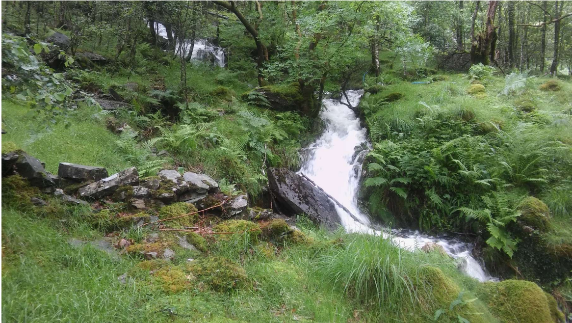
Figure 14: Pre-installation 29/06/2016