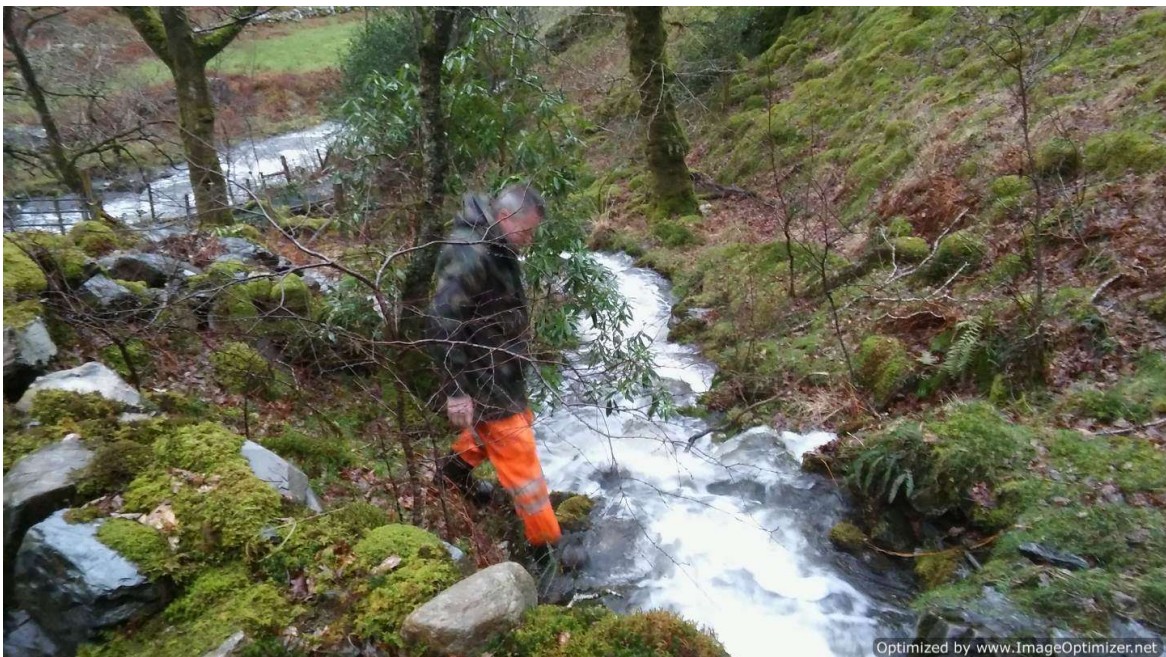
Figure 19: 21/12/2019 (Post commissioning)