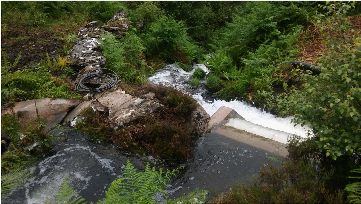
Figure 6: 29/06/2016 (After intake installation but before HEP operation)