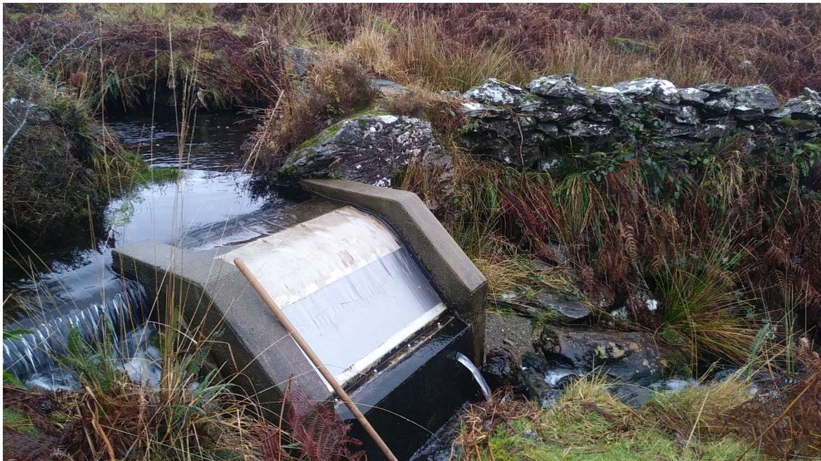
Figure 7: 21/12/2019 (Post commissioning HEP in operation)