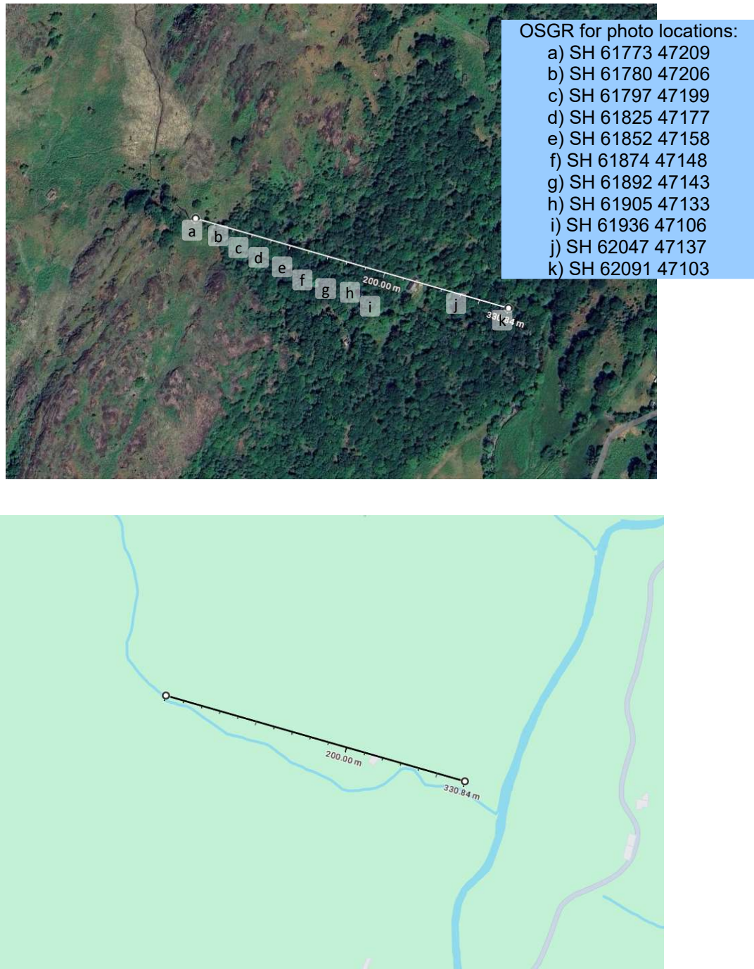
Figure 1: Satellite and map image showing photo survey positions

The geomorphology survey consists of photographs of channel sections which illustrate stream conditions under different flow rates. Photographs predominantly compare conditions during surveys and post installation over a period from 2014 to 2019. The locations along the deprived reach from intake to discharge are labelled (a) to (k) and shown in Figure 1.