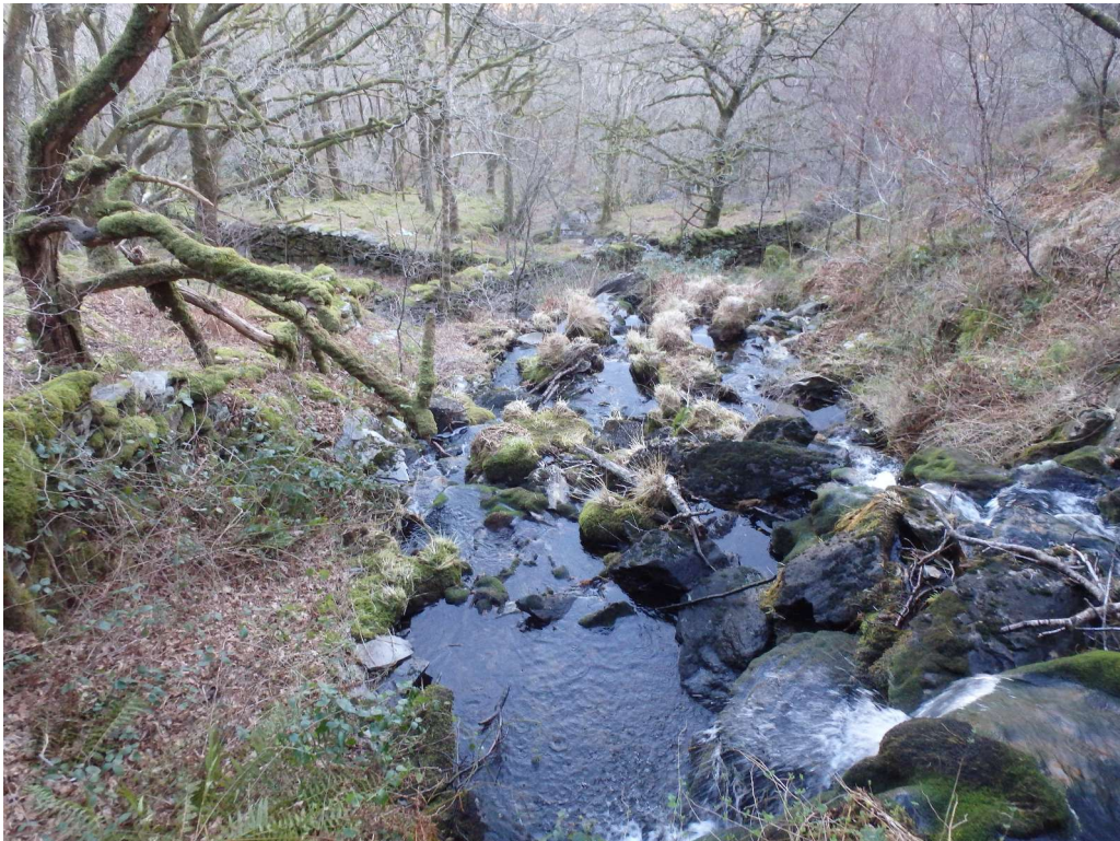
Figure 11: 15/02/2016 site survey pre-installation