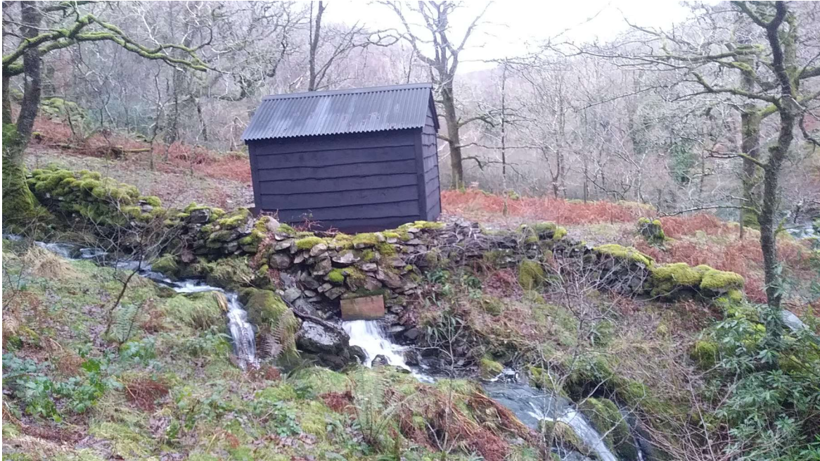
Figure 18: 21/12/2019 (Post commissioning)