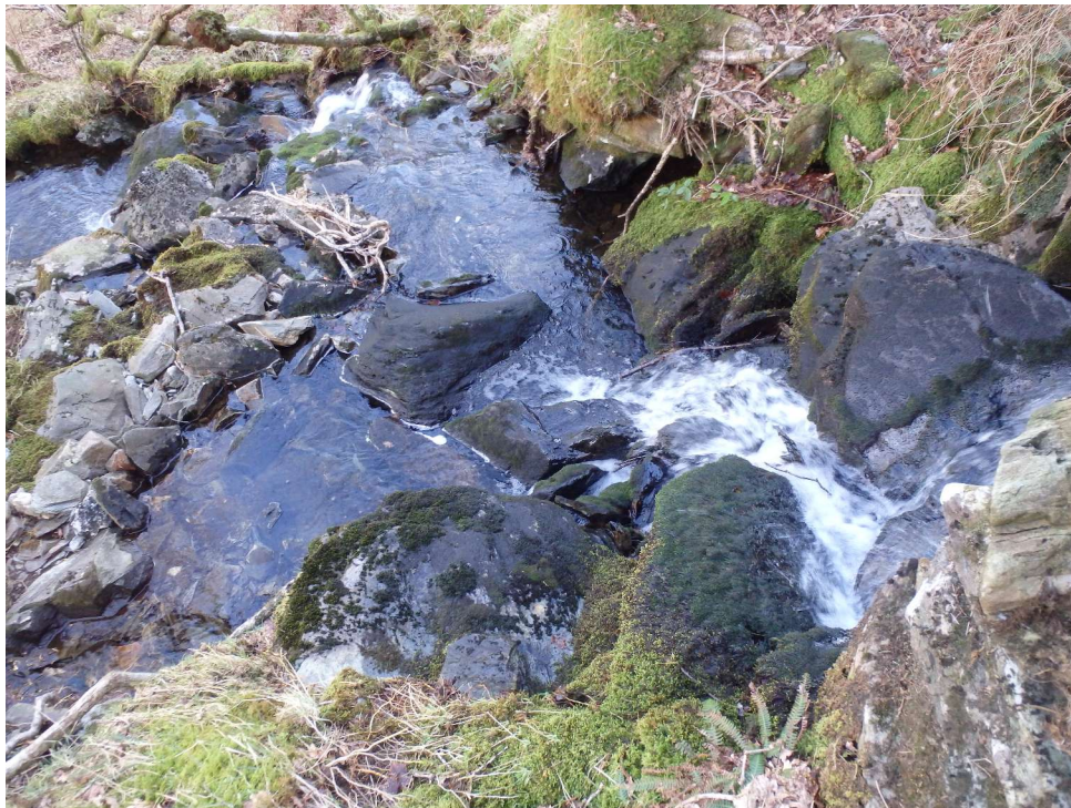
Figure 9: 15/02/2016 Site Survey pre installation