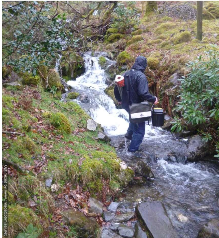
Figure 16: 22/04/2014 (site survey)