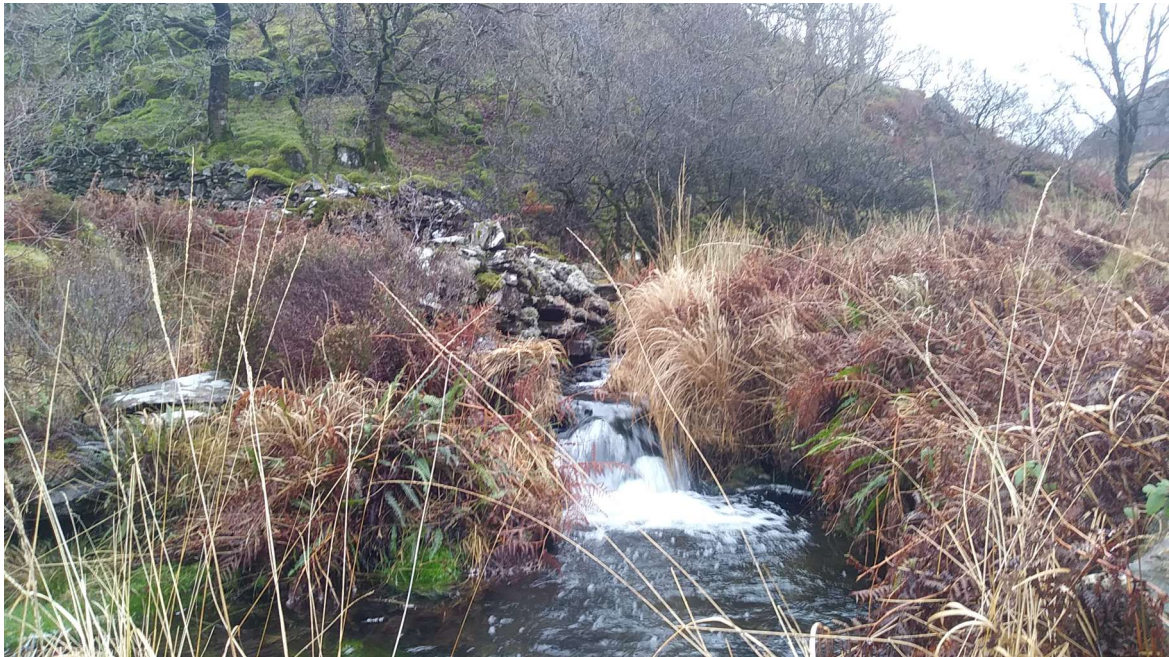
Figure 2: 15/02/2016 Site Survey pre installation