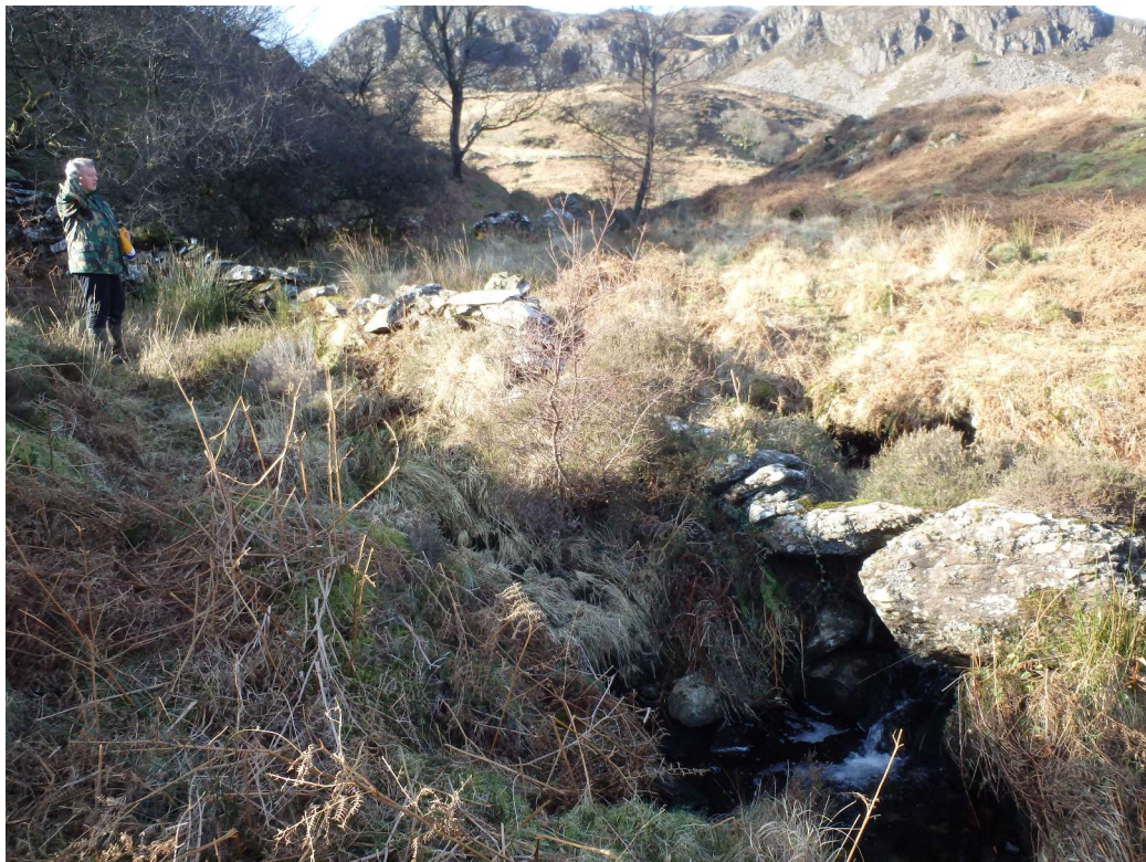
Figure 3: 20/04/2016 (Pre-construction)