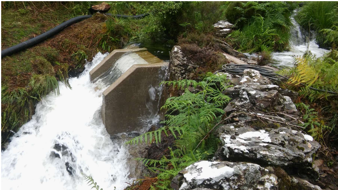
Figure 5: 29/06/2016 (After intake installation but before HEP operation)