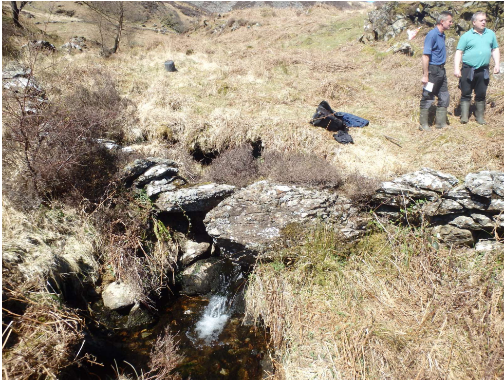
Figure 4: 20/04/2016 (Pre-construction)