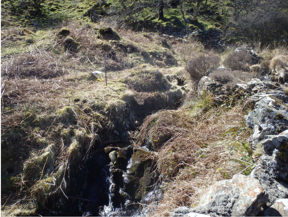
Figure 8: 20/04/2016 (Pre-construction)