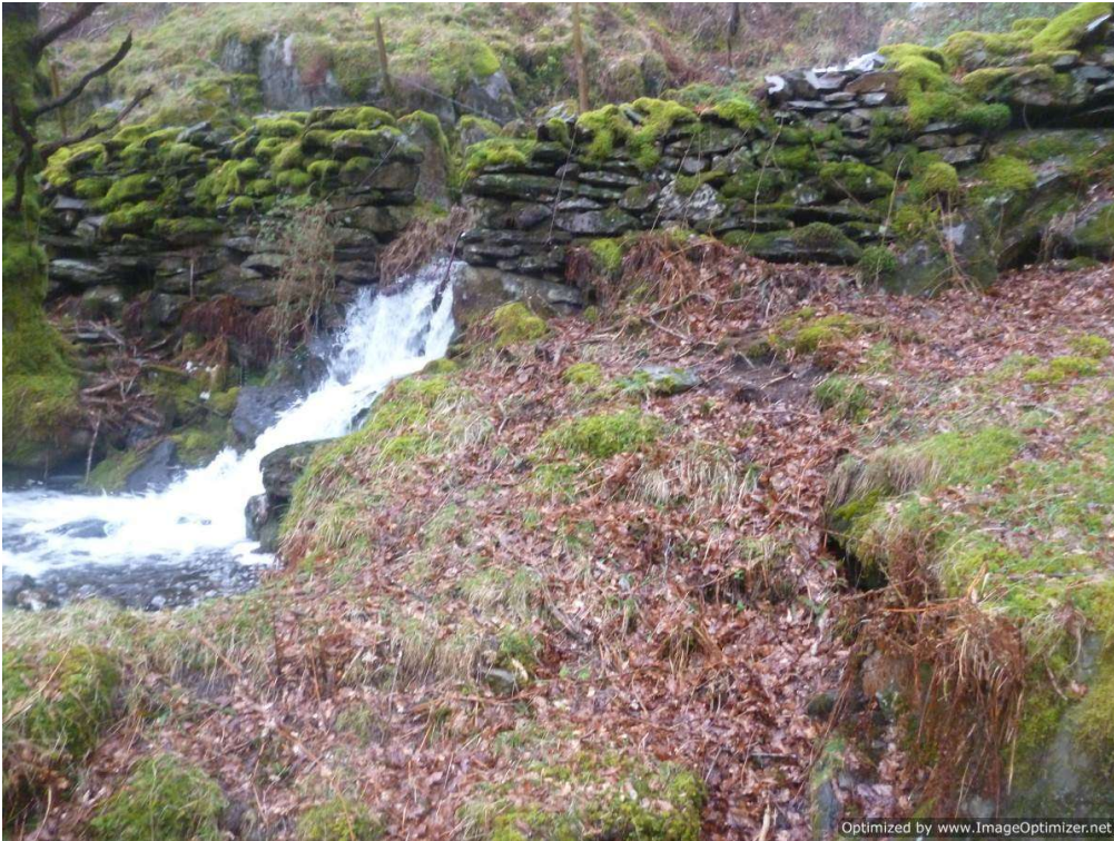
Figure 12: 22/04/2014 (site survey)