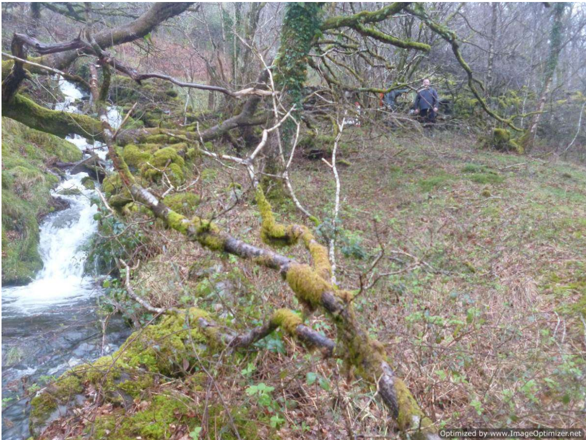
Figure 15: 22/04/2014 (site survey)