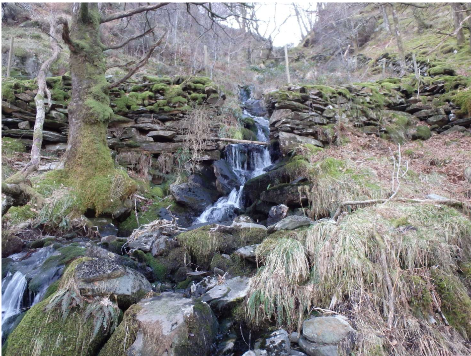
Figure 13: 15/02/2016 Site Survey pre installation