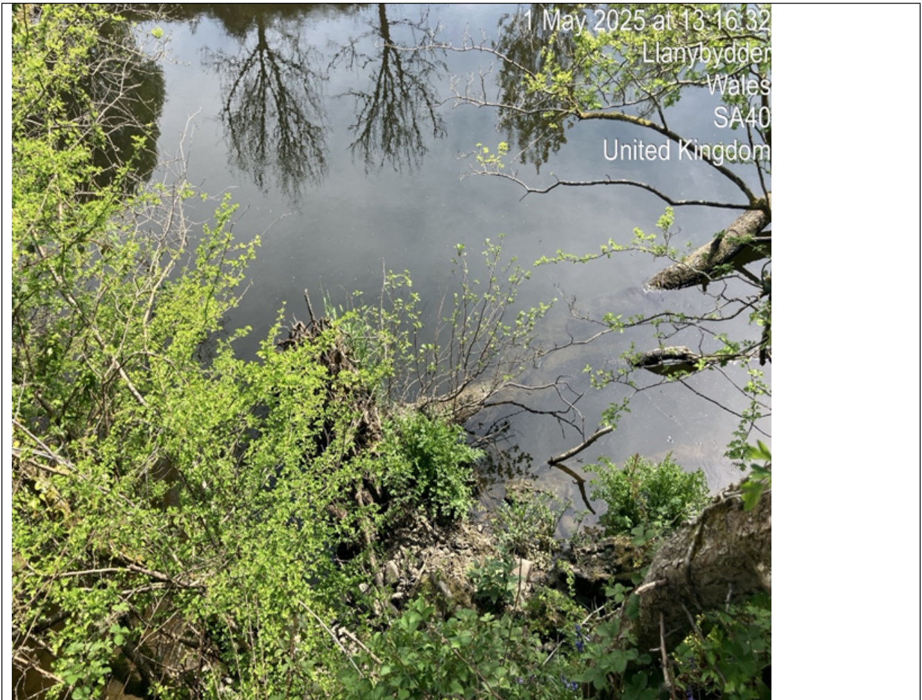
Photograph 1: Detailed as 'point of entry in river Teifi showing no safe access to outfall'