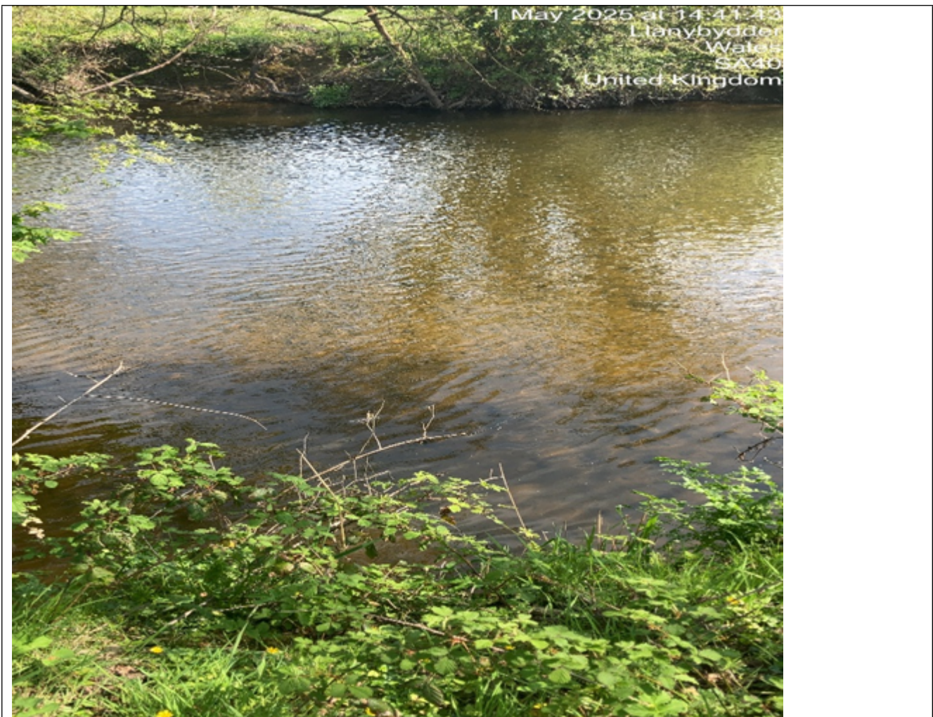
Photograph 2: Detailed as 'downstream at safe access where samples were taken'

Although the downstream sample and photograph show that there was no long term significant downstream impact, the sample results from the EDM spill point do demonstrate that there would have been an impact to the Afon Teifi at the outfall location.