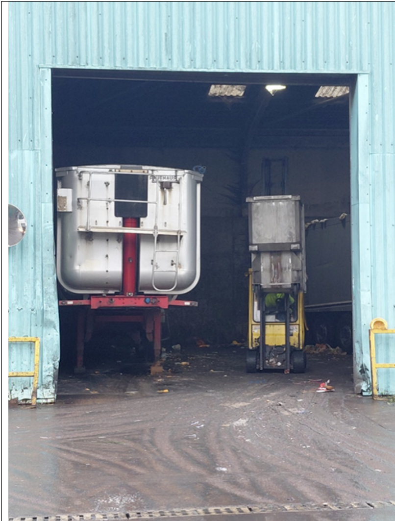
Image 1 - Food waste container

Image 1 shows food waste is stored in large tank in a building, as required by table S1.1 within the permit.