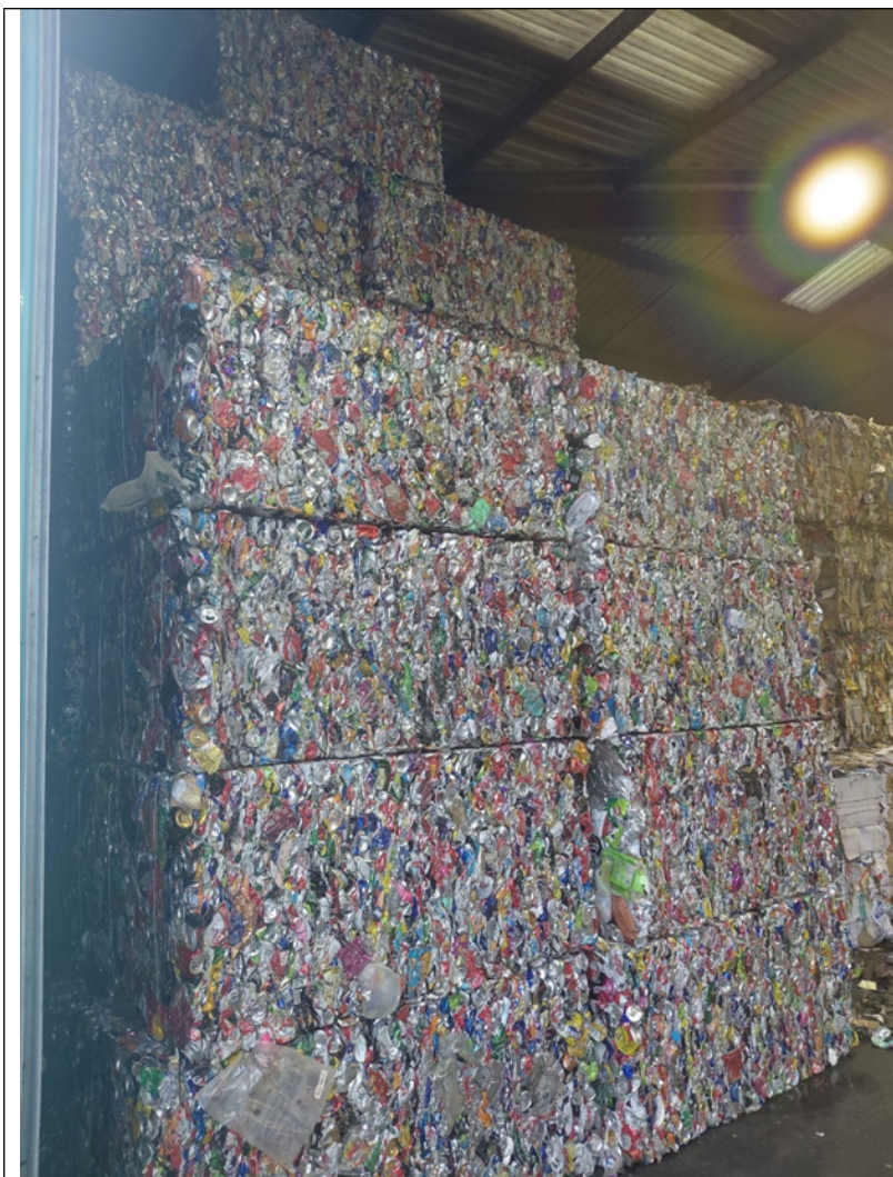
Image 4 - Baled cans