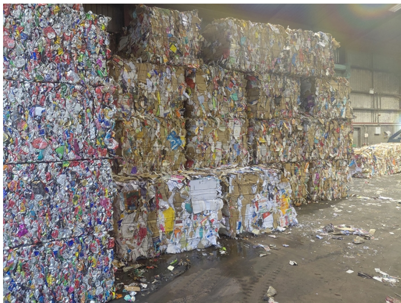
Image 3 - Baled cardboard and paper