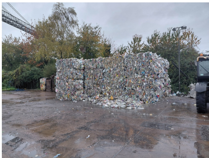
Image 5 - Baled plastics