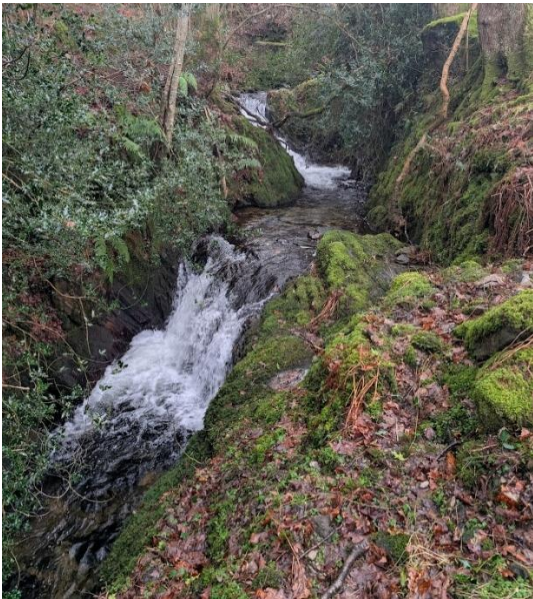
f) Woodland 150meters from the discharge point