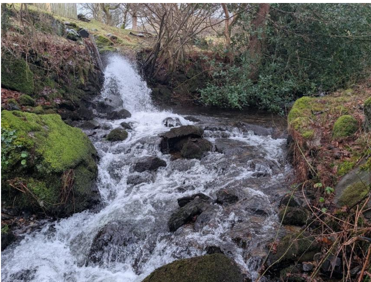
2. Discharge Point SH 57399 59858