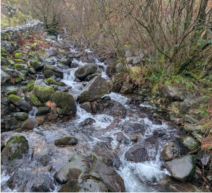
e) Bridge, Cae'r Fran looking up towards the weir