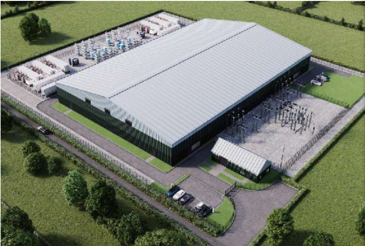
Figure 7 – Indicative LLŷr Substation