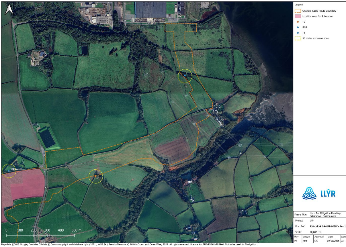
Figure 5 - Llŷr Onshore cable route approach to Pembroke Power Station