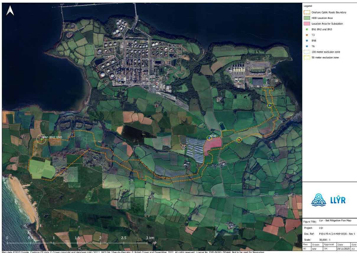
Figure 1 - Llŷr Onshore Development Envelope

The application details a project design envelope, which sets out a series of realistic design assumptions from which worst-case parameters are identified and allows specific reasoned maximum extents for key assessment parameters to be assessed on a ‘realistic worst-case’ basis. The final design of the proposed Project will fall within the maximum extents of the parameters defined. The footprint of the onshore infrastructure and associated temporary works, comprised of the Onshore Export Cable Corridor and the Onshore Substation, as defined, and including new access routes, that forms the onshore boundary for the planning application.