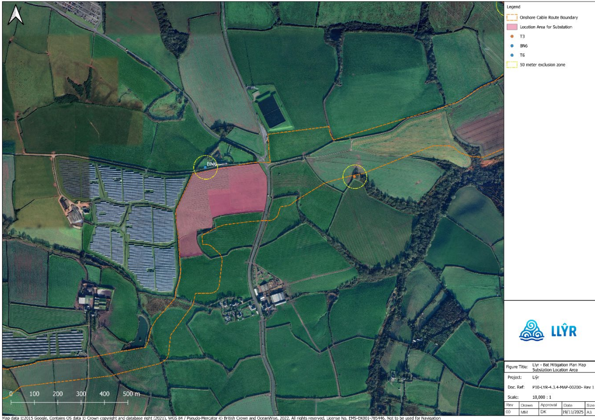
Figure 4 - Llŷr Onshore Substation Site