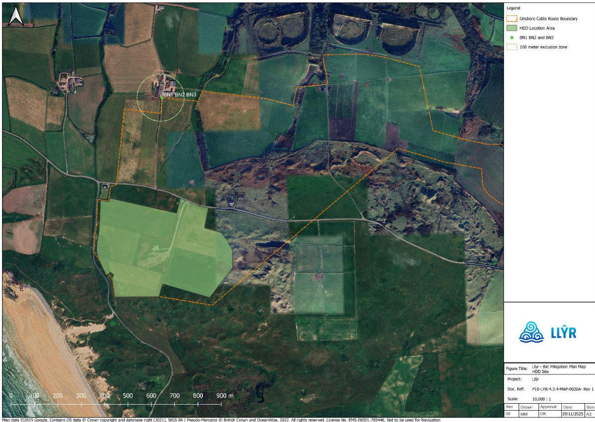
Figure 3 - Llŷr - Onshore HDD Site