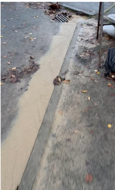
Fig2: Silt discharge entering road drain