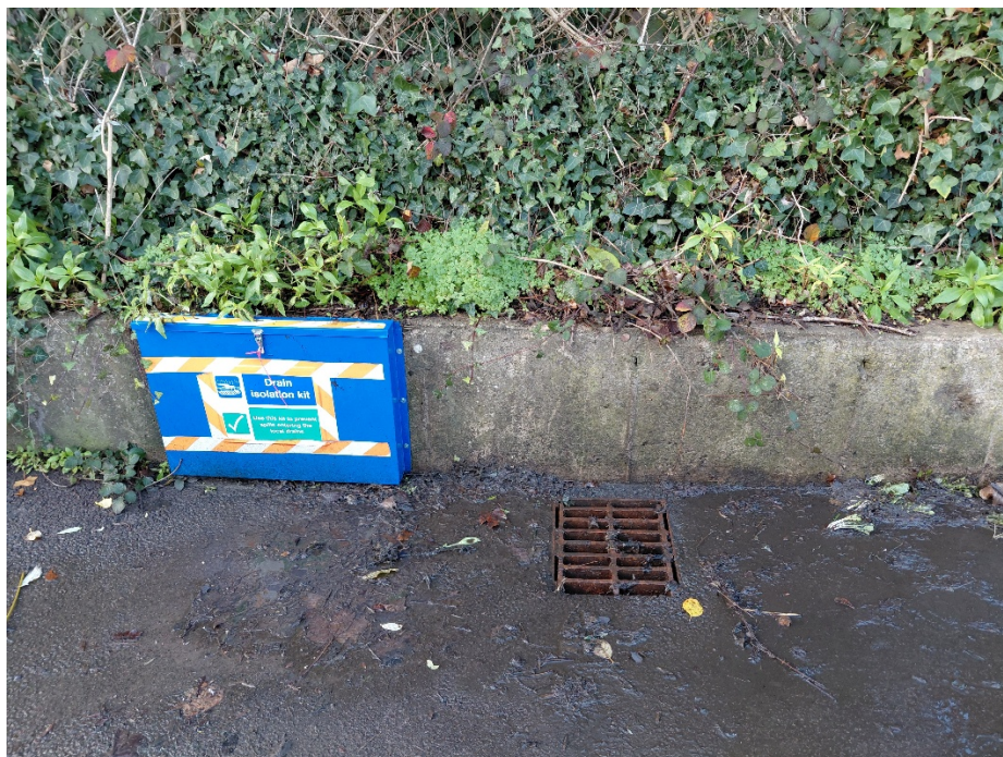
Photo 5 - Sealable drain

The permitted boundary was bunded with sealable drainage as shown in photos 4 and 5 and checked regularly as part of internal auditing procedures.