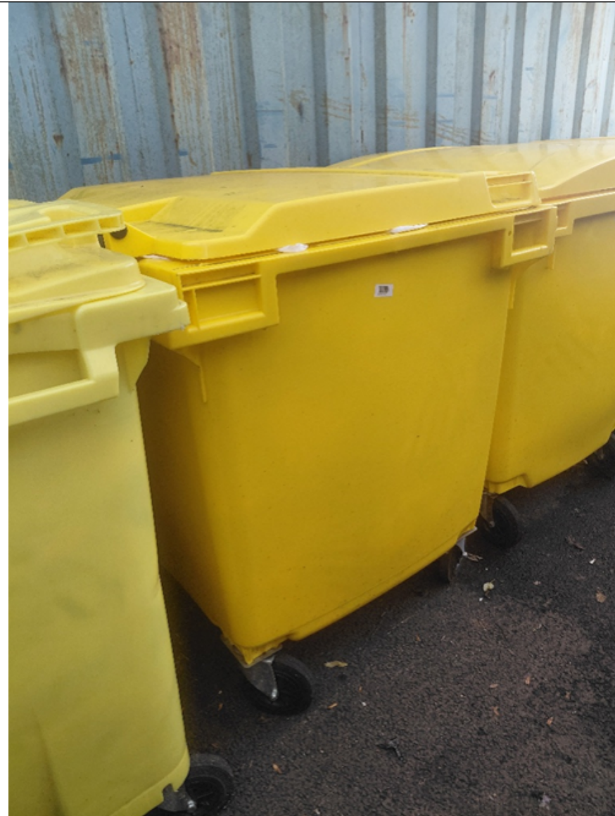
Photo 3 - Waste bins locked and in good condition

The bin area was clean and tidy, with no waste on the floor. The bins were in good condition with none overflowing.