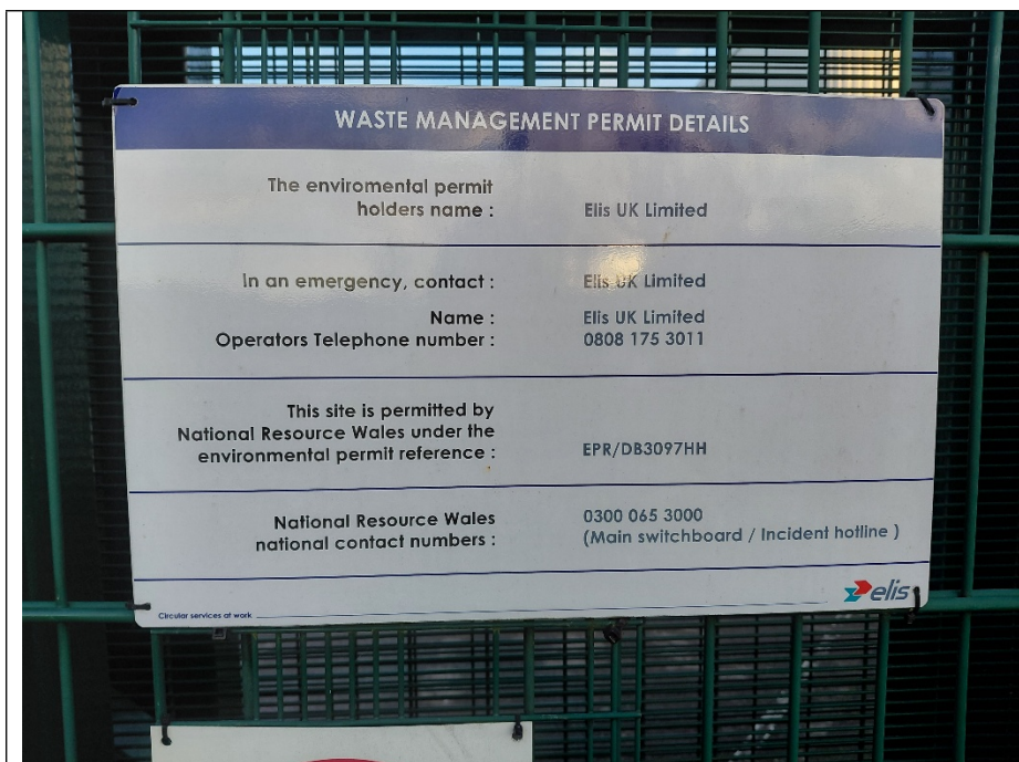
Photo 6 - Sign on front gates with emergency contact details

The site has good security, with an intercom on gates and an emergency contact with permit number on gate for public use shown in photo 6.