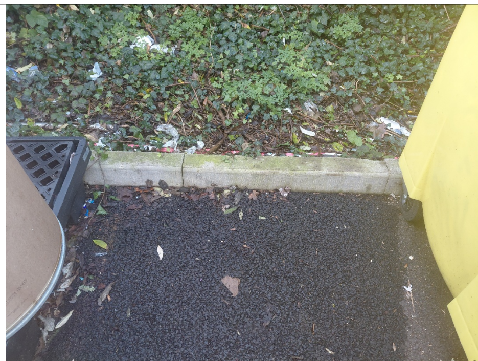
Photo 4 - High curb bund which surrounds the site in good condition