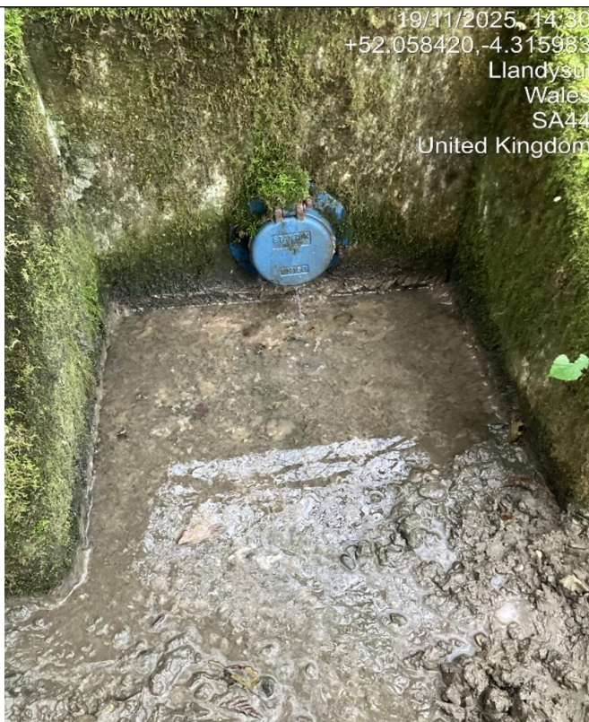
Photograph 1: Photograph showing the discharge entering the Nant Ythan from Pentrellwyn PS on the 19 November 2025

Photograph 2 below shows the Nant Ythan downstream of Pentrellwyn PS during the emergency discharge on the 19 November 2025. As shown by photograph 2, the discharge did not cause discolouration in the watercourse.