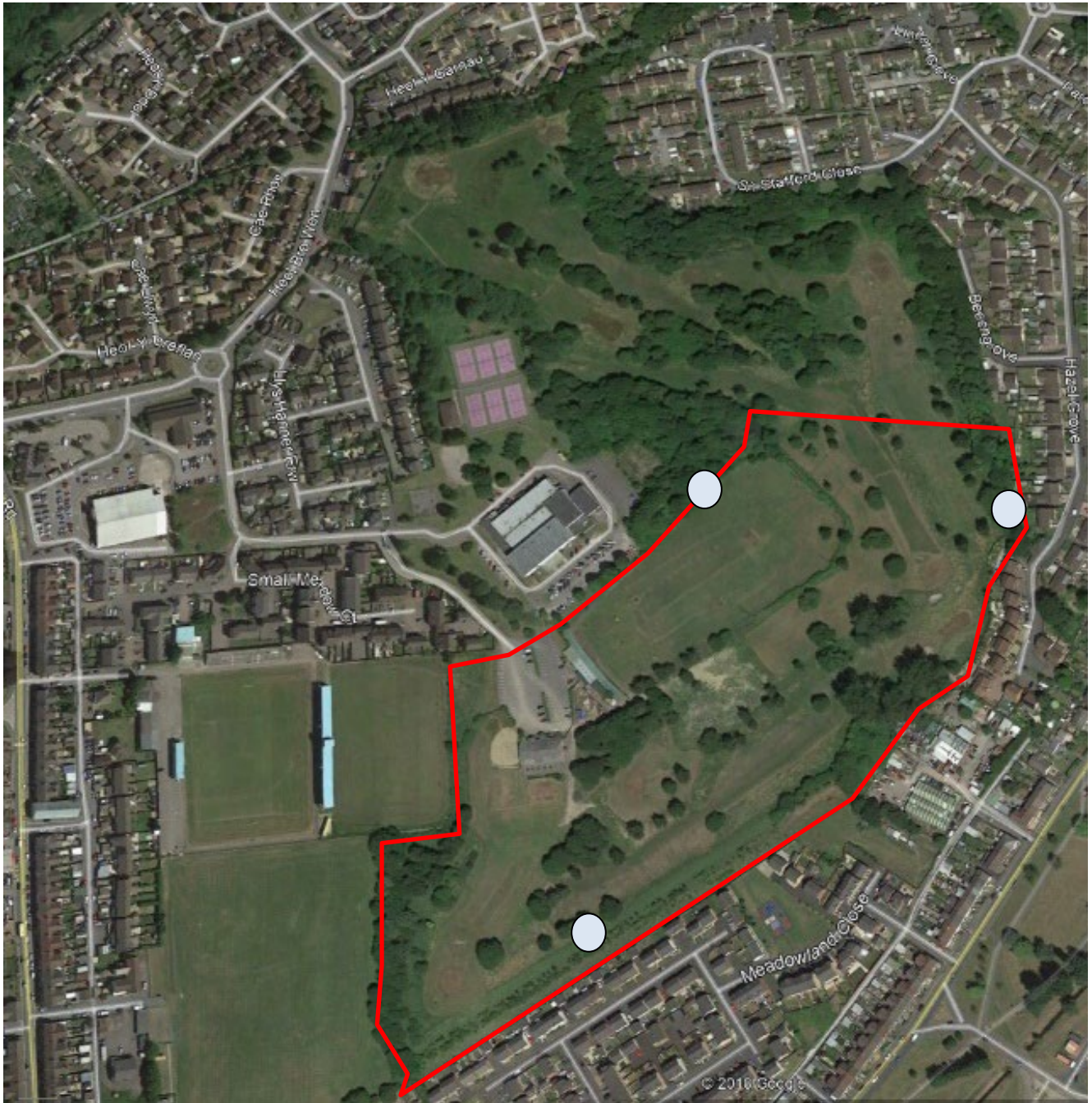
Drawing 1-identifying the 3 assessment points