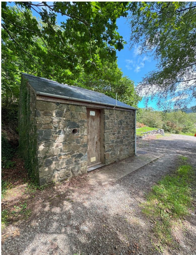
Level Meter Location