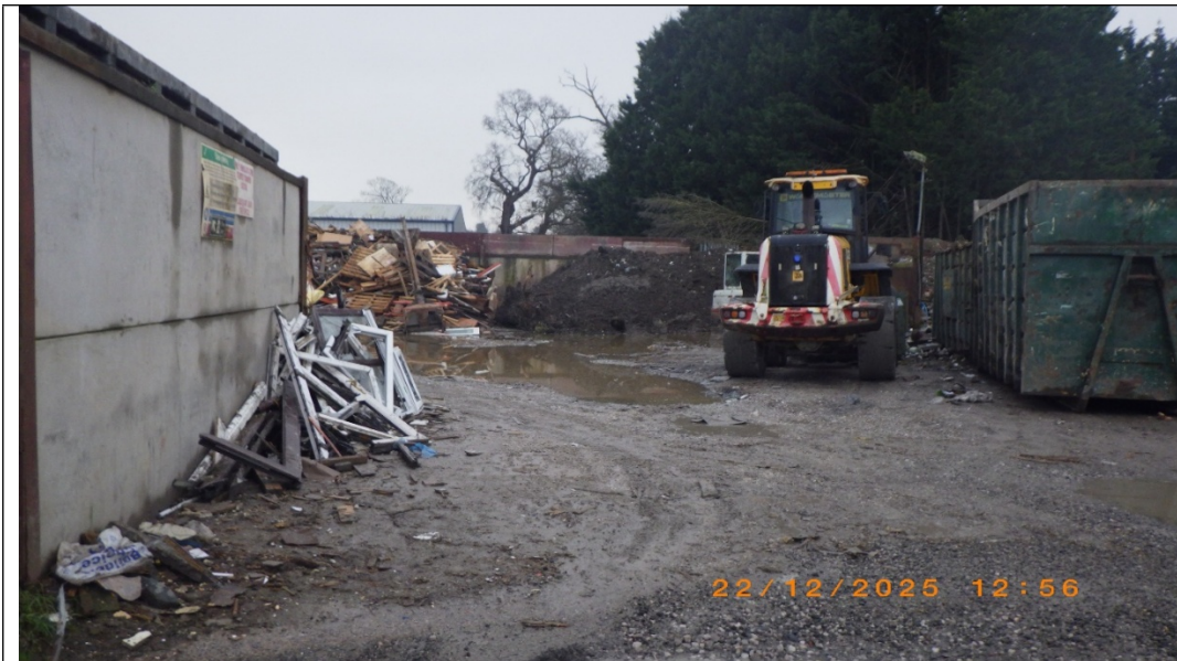
Standing water in the storage yard