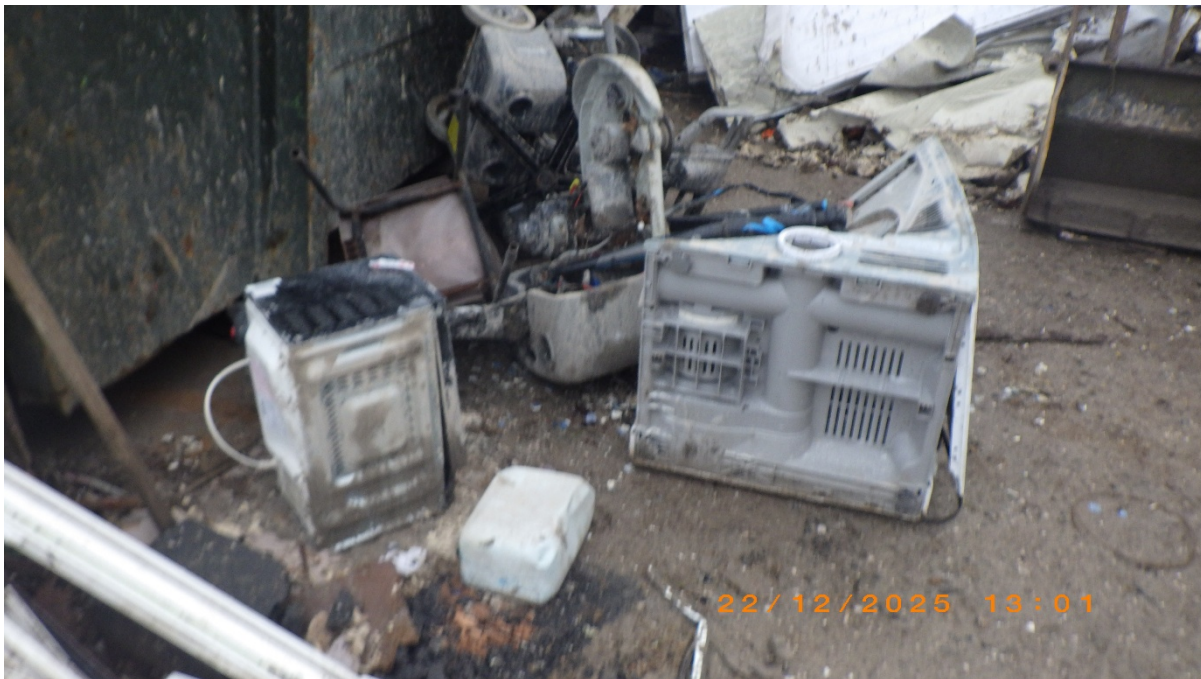
WEEE items stored on the ground

Unpermitted waste types were also seen onsite such as pressurised gas containers and small WEEE items which were stored in the area described as “ wood waste storage “ on the site plan. Please see photos below.