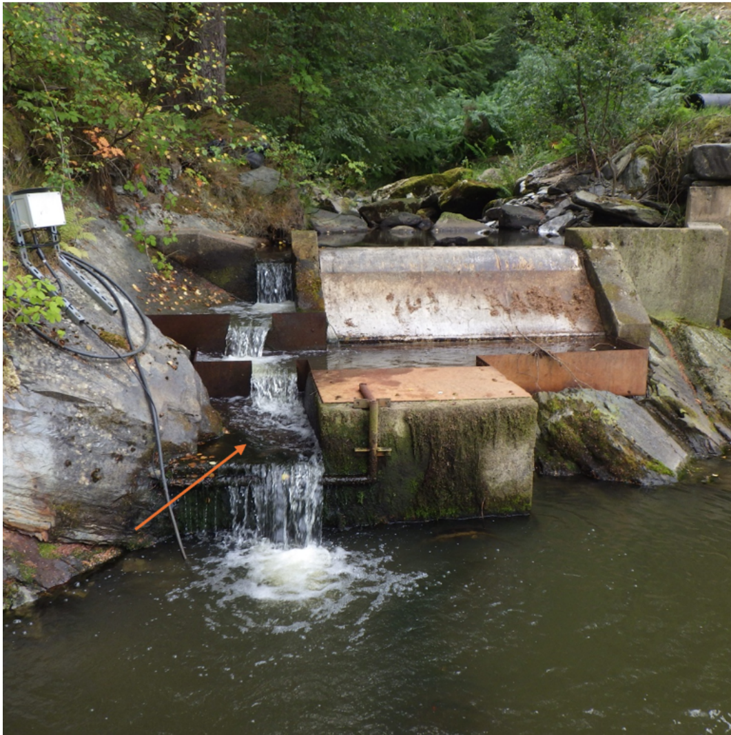
PICTORIAL VIEW EXTENT OF STEEL TRAY SHOWN IN DARK RED.