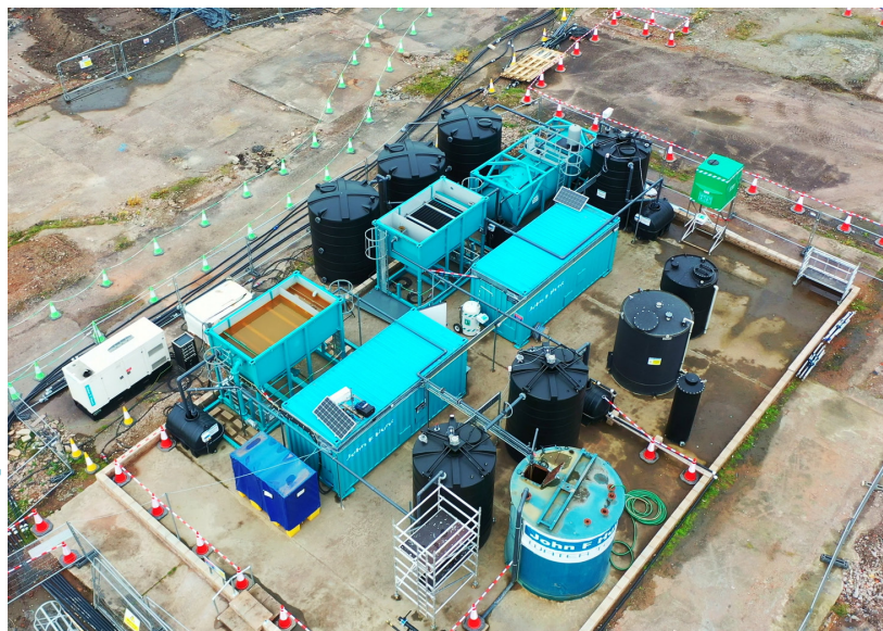
Water treatment plant at SPARK

mixing was to be discharged to foul sewer, but due to the urban setting and sensitivity of the local sewer network and local effluent treatment facilities, a discharge consent with limits better than current drinking water quality was imposed. In order to meet these requirements, an ion exchange system was designed to further improve effluent quality; this was very challenging as the site had high elevations of boron in the groundwater, an infamously recalcitrant metal.