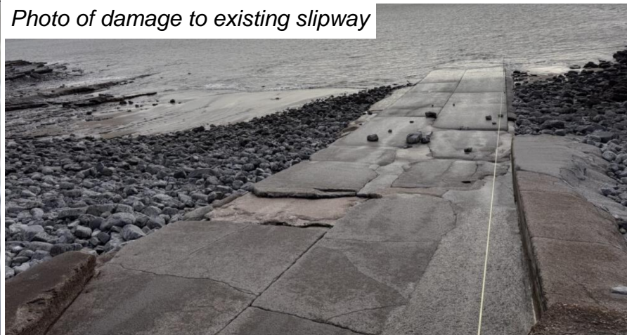
Photo of damage to existing slipway

NW 51.39898,-3.53185 NE 51.39905,-3.53167 SW 51.39870,-3.53156 SE 51.39877,-3.53138