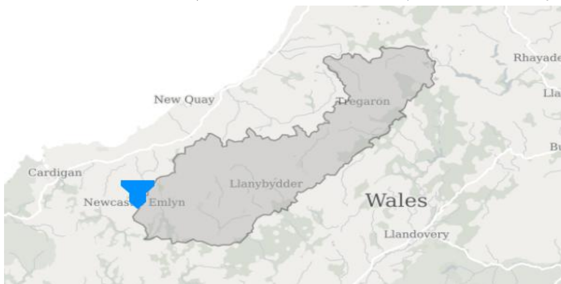
Catchment Boundary Map (Contains Ordnance Survey data © Crown copyright and database right 2026)