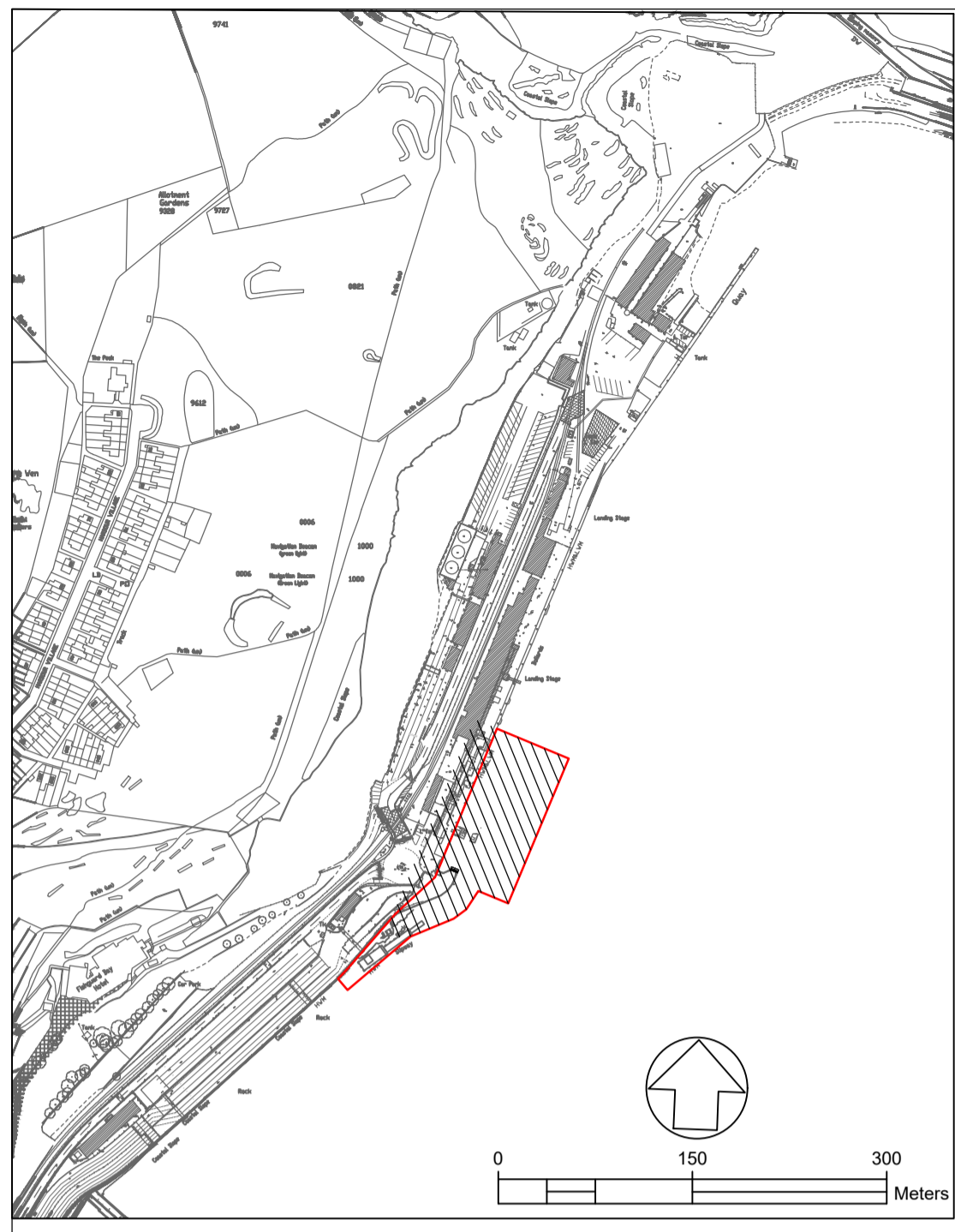
Site Location Plan [1:5000]