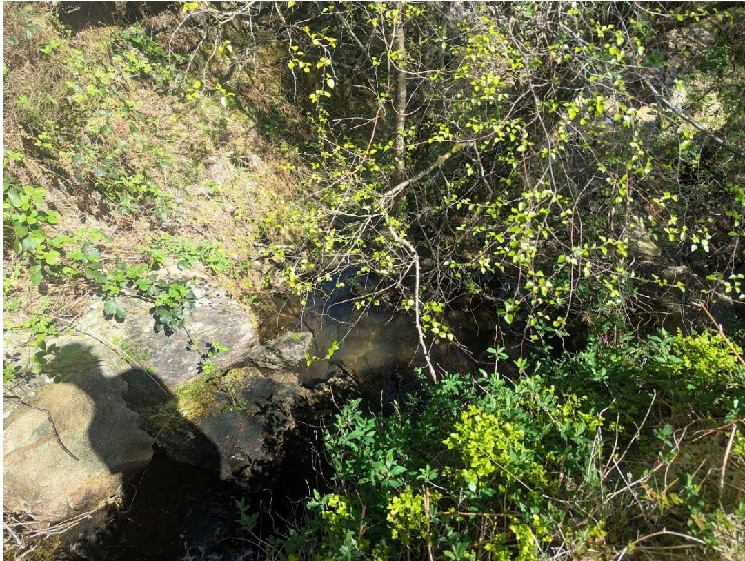
Figure 6: 24/04/2026