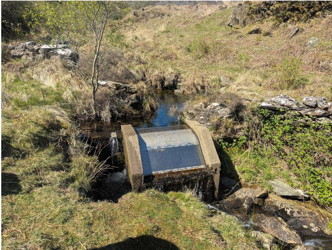
Figure 4: 24/04/2026