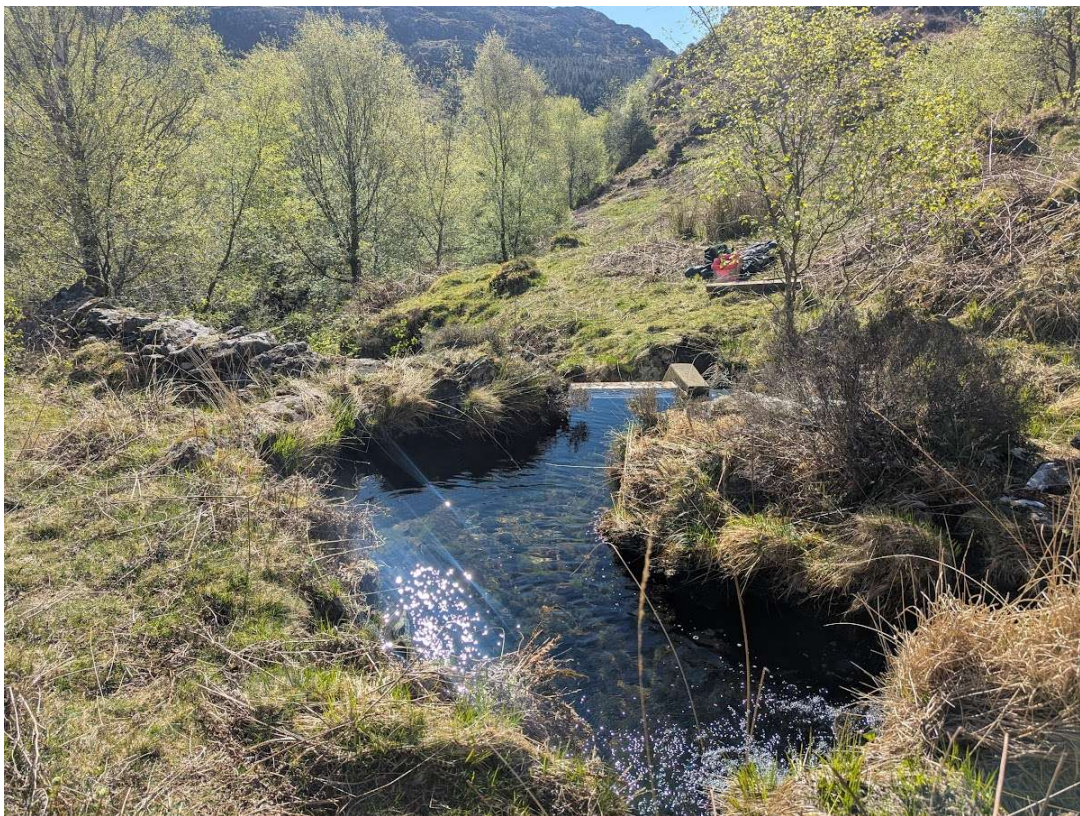
Figure 3: 24/04/2026