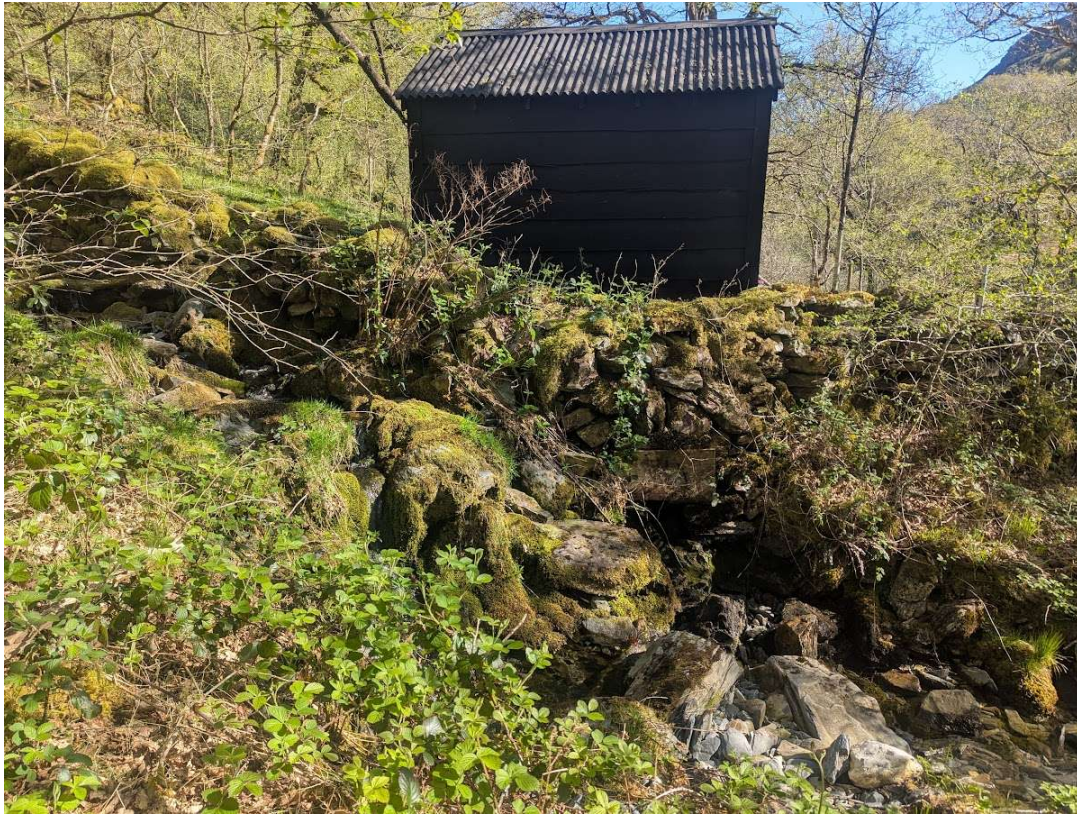
Figure 18: 24/04/2026