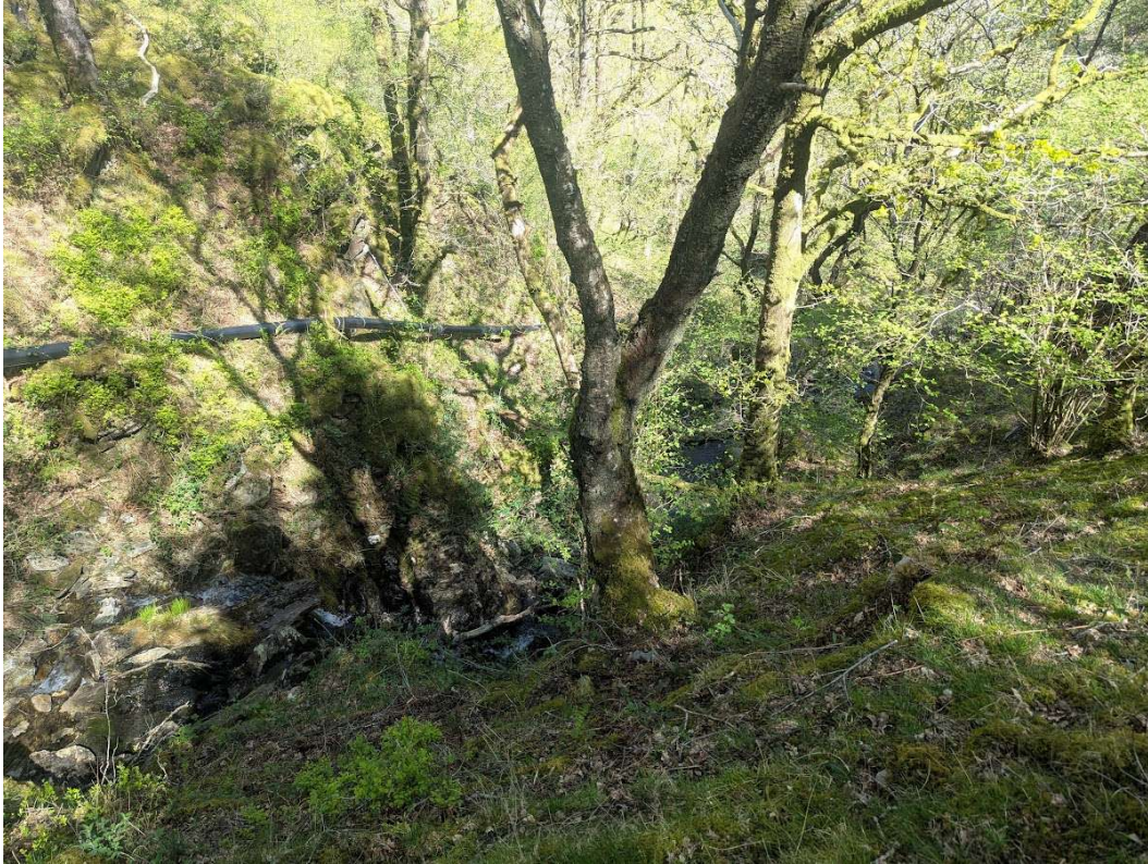
Figure 10: 24/04/2026