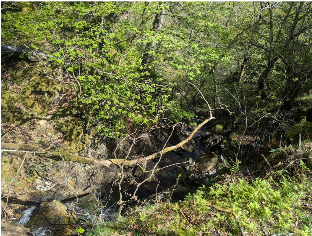
Figure 9: 24/04/2026