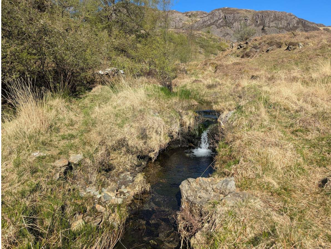
Figure 2: 24/04/2026