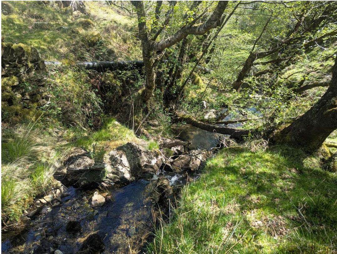
Figure 8: 24/04/2026