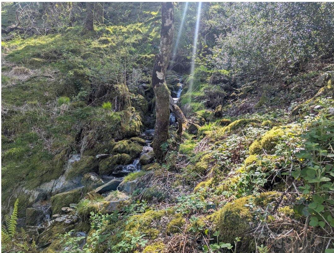
Figure 17: 24/04/202