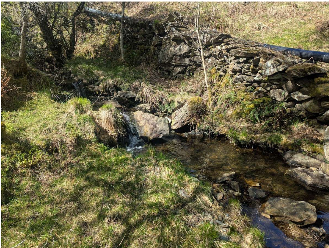
Figure 7: 24/04/2026