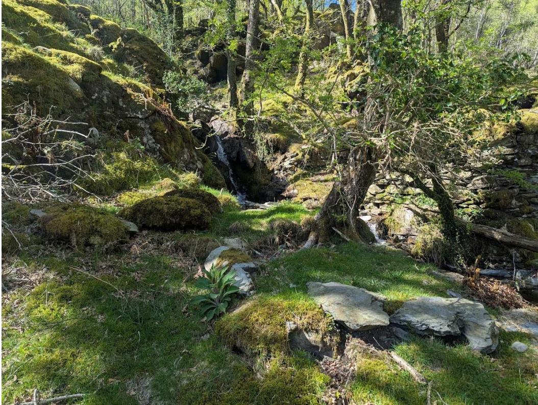
Figure 14: 24/04/2026