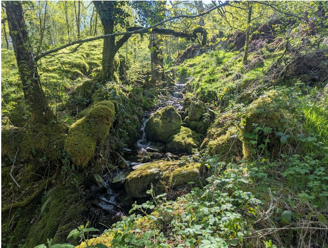
Figure 16: 24/04/2026