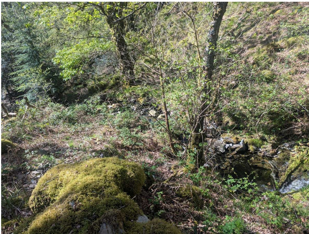
Figure 19: 24/04/2026