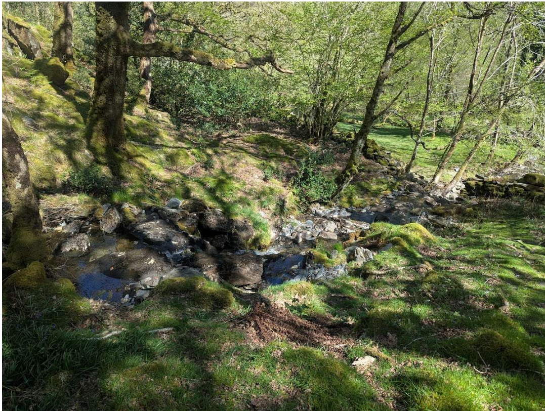
Figure 15: 24/04/2026