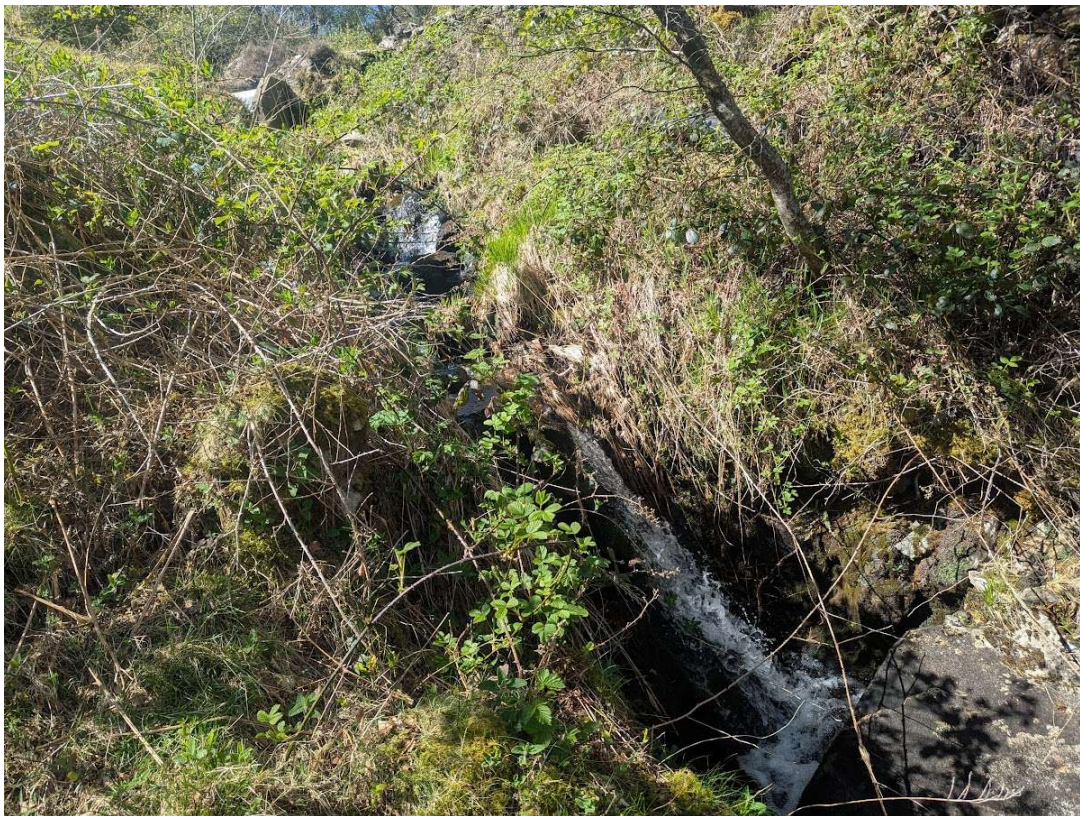
Figure 5: 24/04/2026