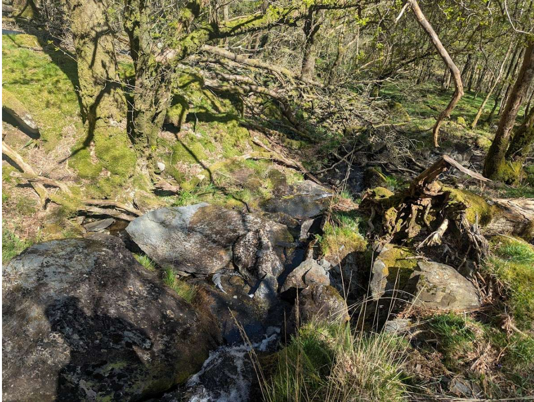
Figure 12: 24/04/2026