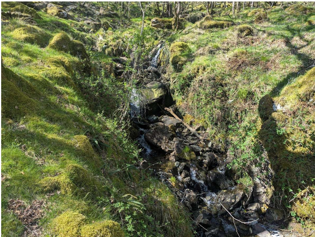
Figure 13: 24/04/2026