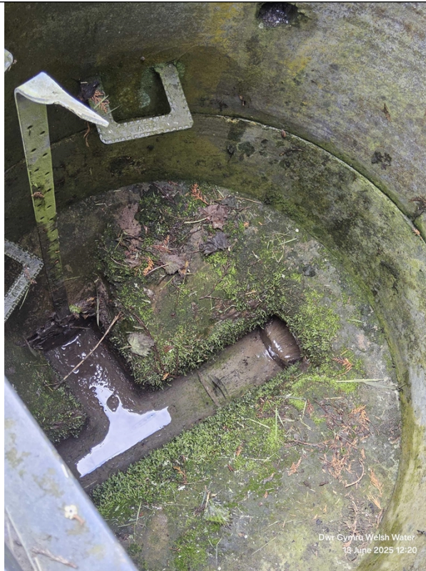
Photograph 1: Final effluent sample point at the time of sampling

Whilst NRW accepts that the flow at the sample point was too low to sample, NRW ask DCWW to investigate and confirm why flow was observed at the final effluent sample point on the 13 June 2025 when the MCERTS flow meter indicated that final effluent was not discharging from the works. NRW ask for a response from DCWW by no later than the 29 June 2026.