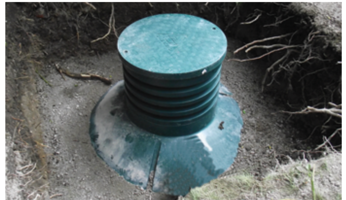
Turret invert extension during installation

The Diamond range offers one of the widest choices for invert extensions giving complete flexibility for different site conditions and installation requirements. This can enable alignment to existing pipework.