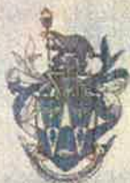
CIWM Executive Director

The Chartered Institution of Wastes Management