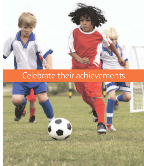
Celebrate their achievements