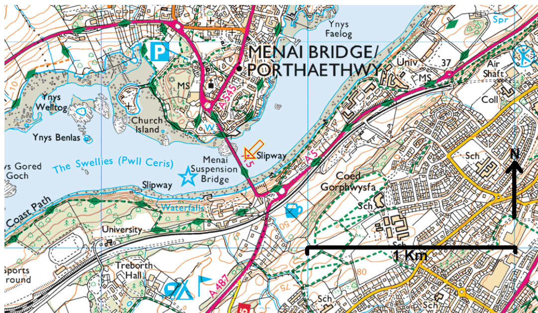
Figure 1. OS mapping (1:25000 scale) works location marked with red arrow

B.1.3 Concrete panels below the pedestrian footway are starting to fail and require replacement. Works are anticipated to commence with commissioning in November 2020 and to last until March 2021.