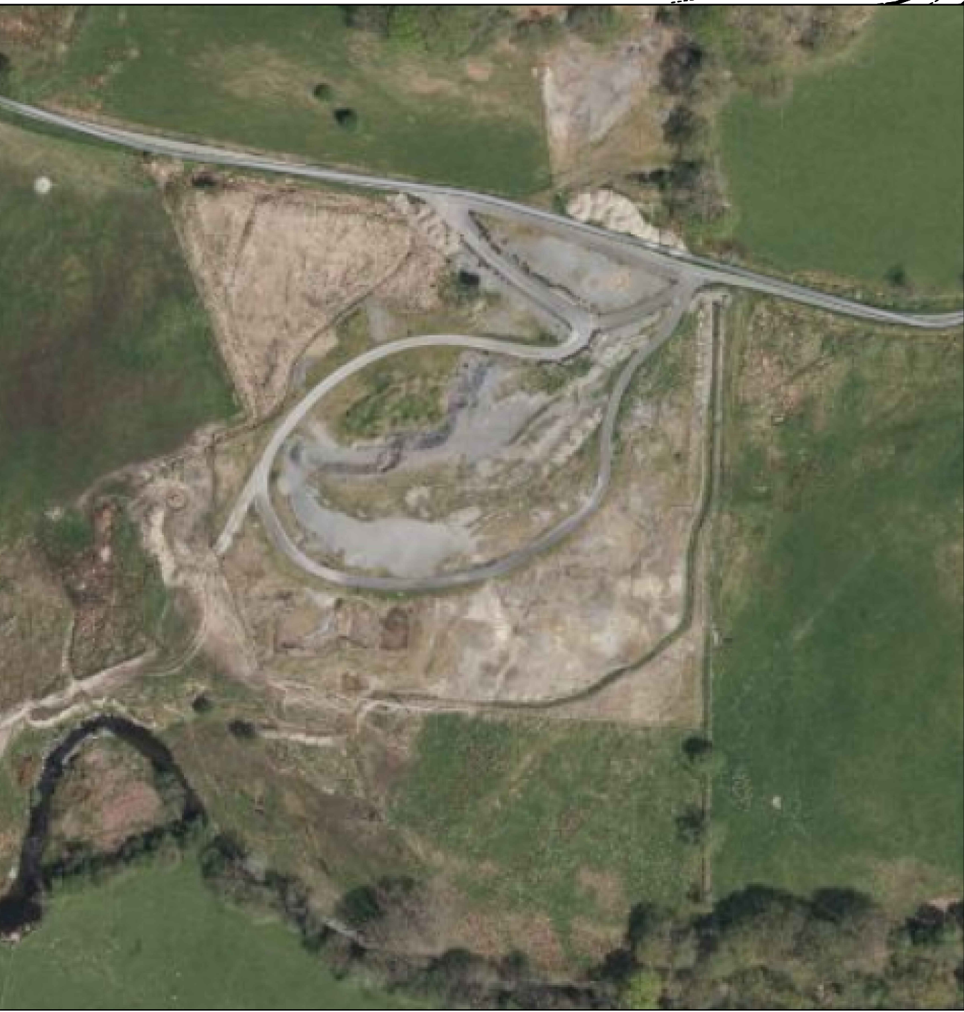
AERIAL VIEW OF SITE NOT TO SCALE