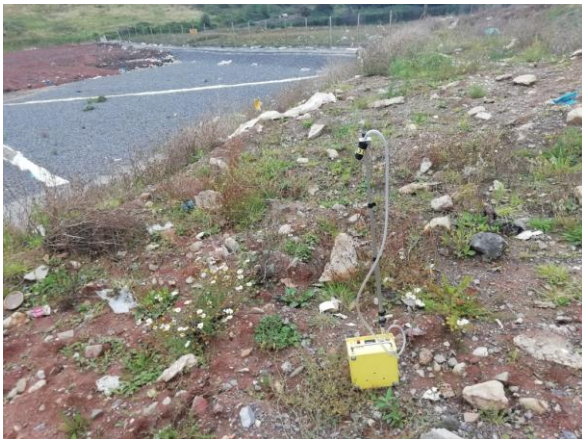
3. Sample 3, cell 5 ridge