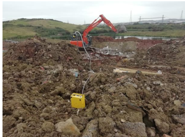
4. Sample 4, asbestos clay bund