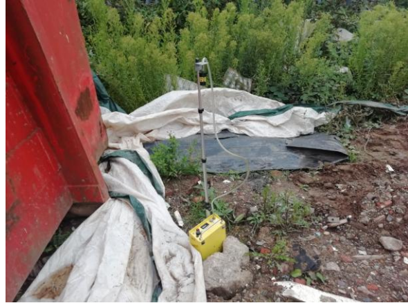
2. Sample 2, Scott Pallets