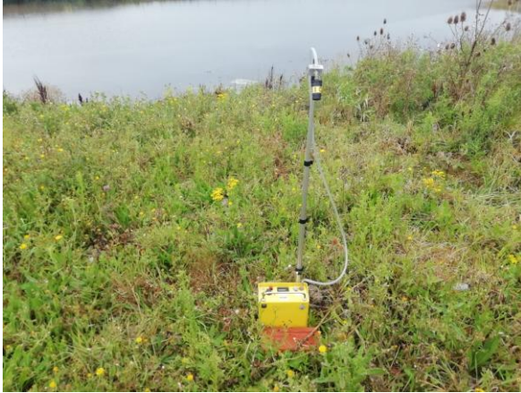
1. Sample 1, lagoon