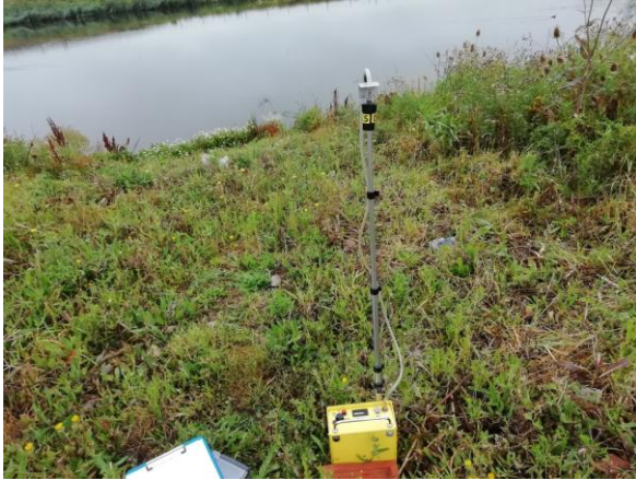
1. Sample 1, lagoon