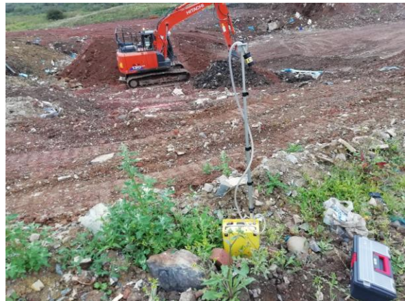
4. Sample 4, asbestos clay bund