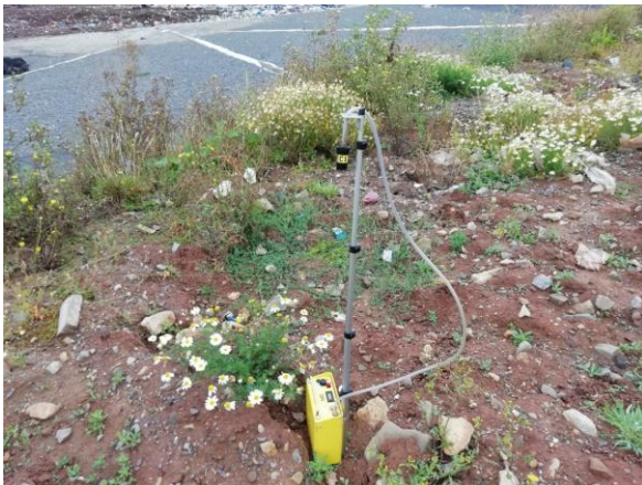
3. Sample 3, cell 5 ridge