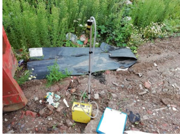
2. Sample 2, Scott Pallets