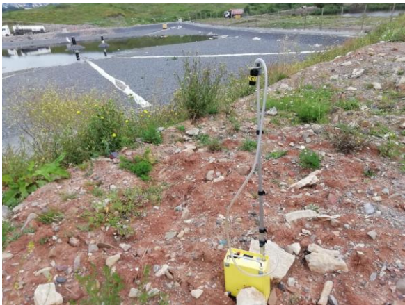
3. Sample 3, cell 5 ridge