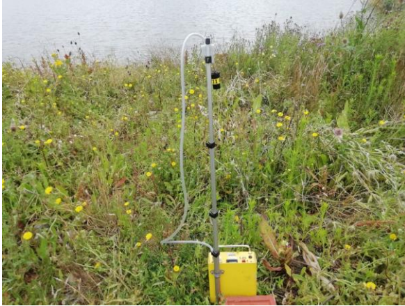
1. Sample 1, lagoon