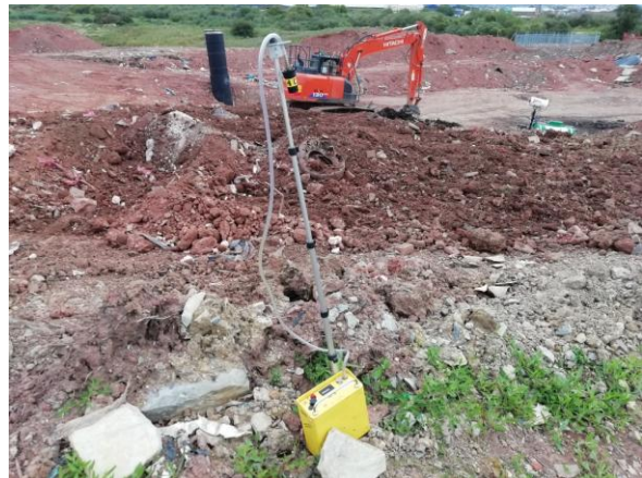
4. Sample 4, asbestos clay bund