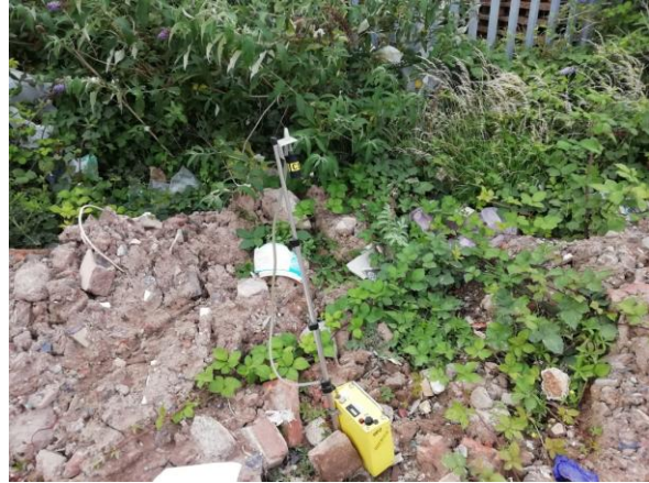
2. Sample 2, Scott Pallets