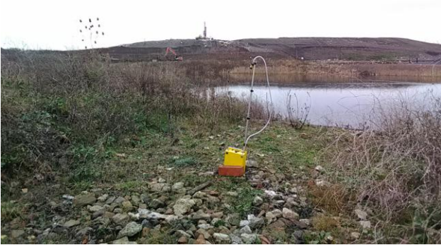
1. Sample 1, lagoon