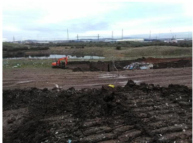
4. Sample 4, asbestos clay bund