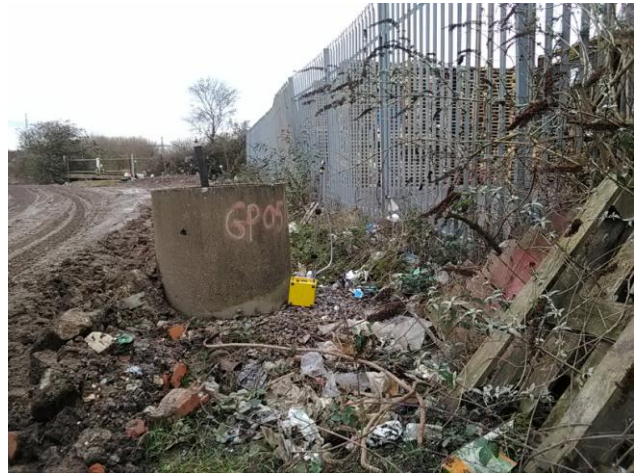
2. Sample 2, Scott Pallets