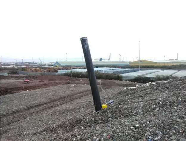
3. Sample 3, landfill