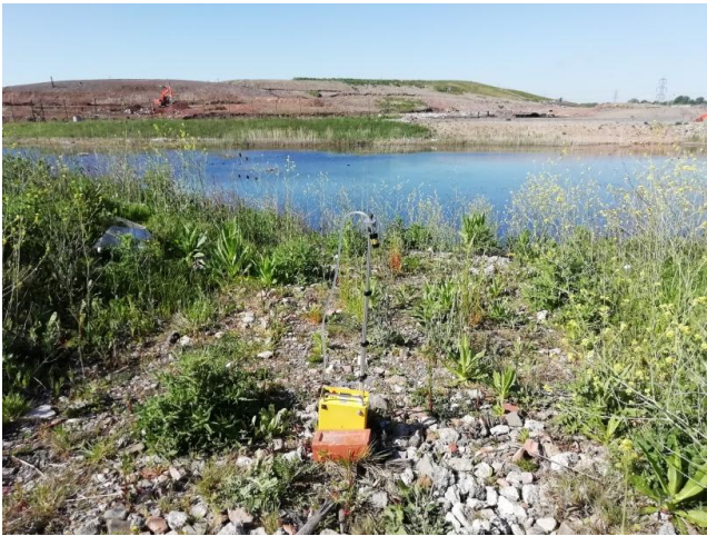
1. Sample 1, lagoon