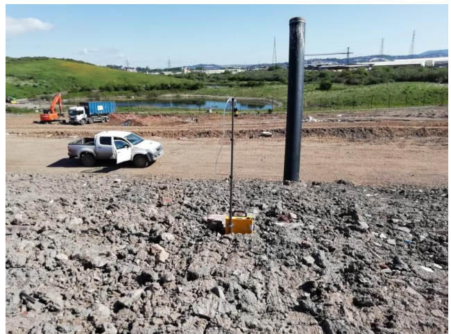
4. Sample 4, landfill