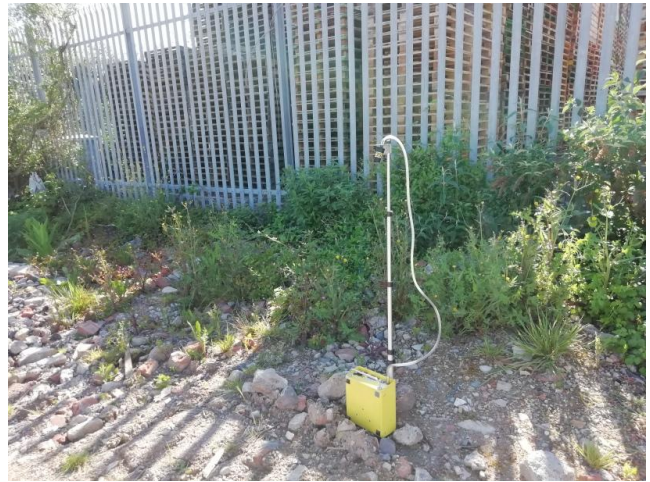
2. Sample 2, Scott Pallets