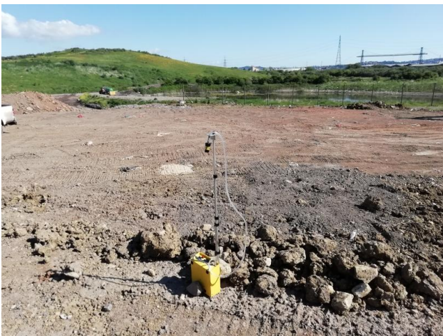
3. Sample 3, asbestos clay bund