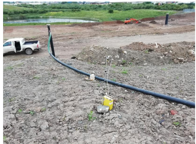
4. Sample 4, landfill