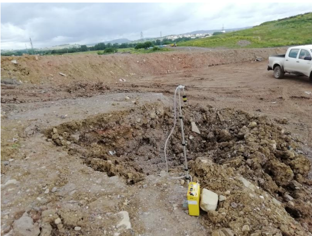
3. Sample 3, asbestos clay bund