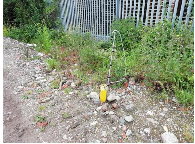
2. Sample 2, Scott Pallets