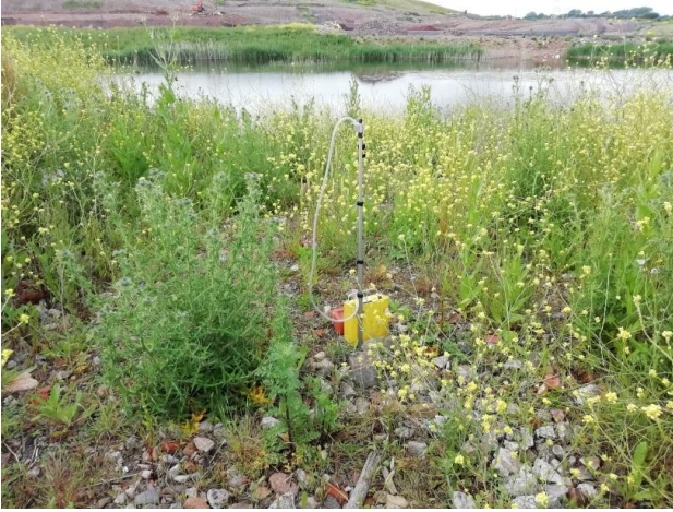
1. Sample 1, lagoon