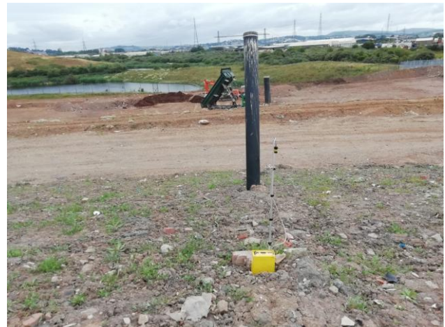
4. Sample 5, landfill