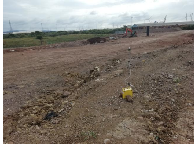
2. Sample 3, asbestos clay bund