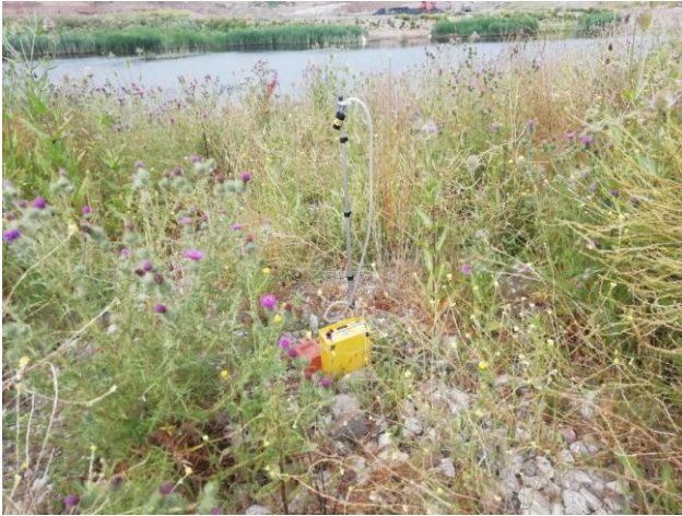
1. Sample 2, lagoon