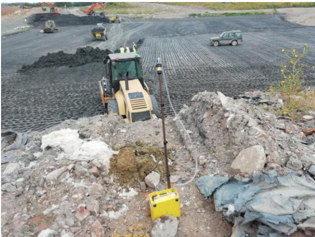
3. Sample 4, cell 5 ridge