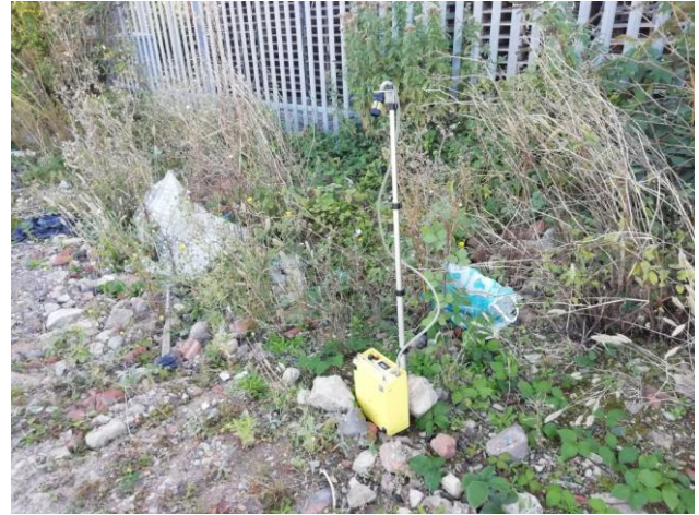
2. Sample 2, Scott Pallets