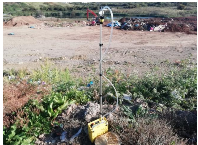
4. Sample 4, asbestos clay bund