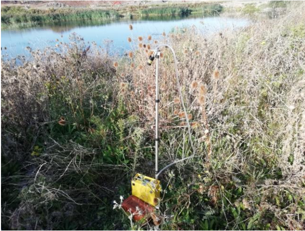
1. Sample 1, lagoon