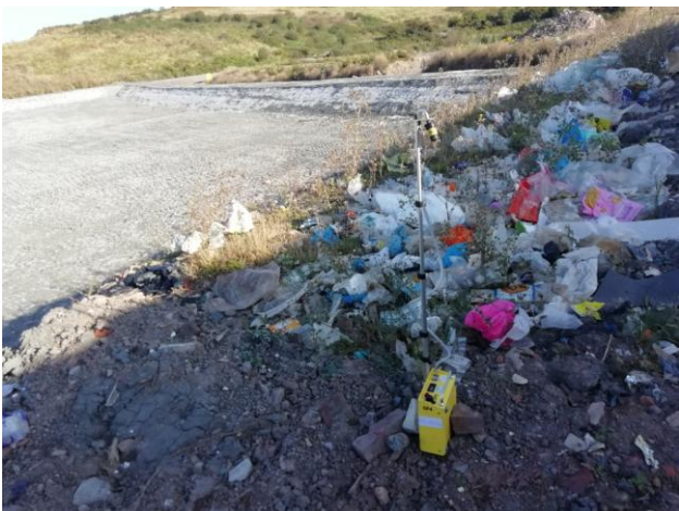
3. Sample 3, cell 5 ridge