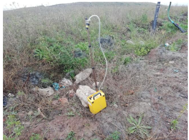
4. Sample 4, landfill