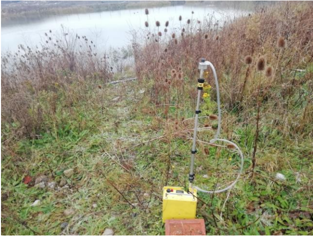
1. Sample 1, lagoon