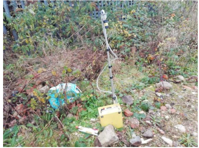
2. Sample 2, Scott Pallets