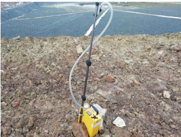
3. Sample 3, cell 5 ridge