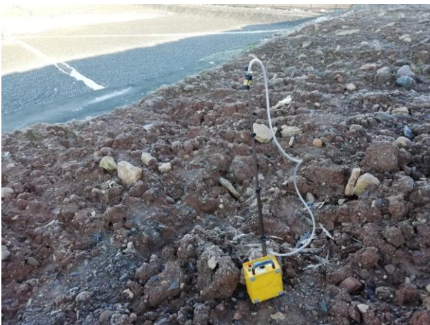
3. Sample 4, cell 5 ridge