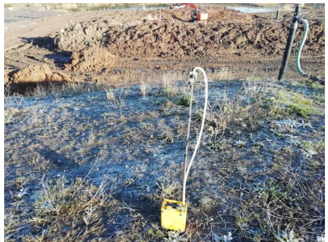
4. Sample 5, landfill