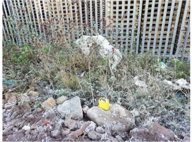
2. Sample 3, Scott Pallets