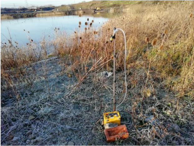
1. Sample 2, lagoon