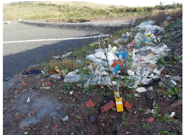
4. Sample 4, cell 5 ridge