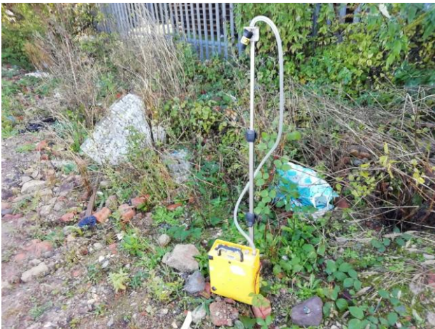
3. Sample 3, Scott pallets