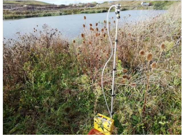
2. Sample 2, lagoon