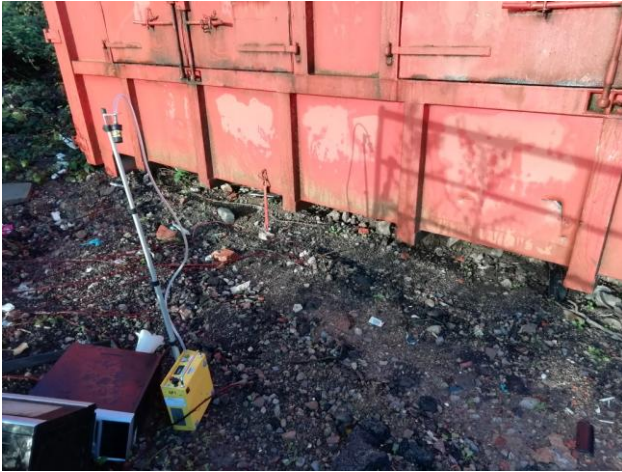
1. Sample 1, public asbestos skip