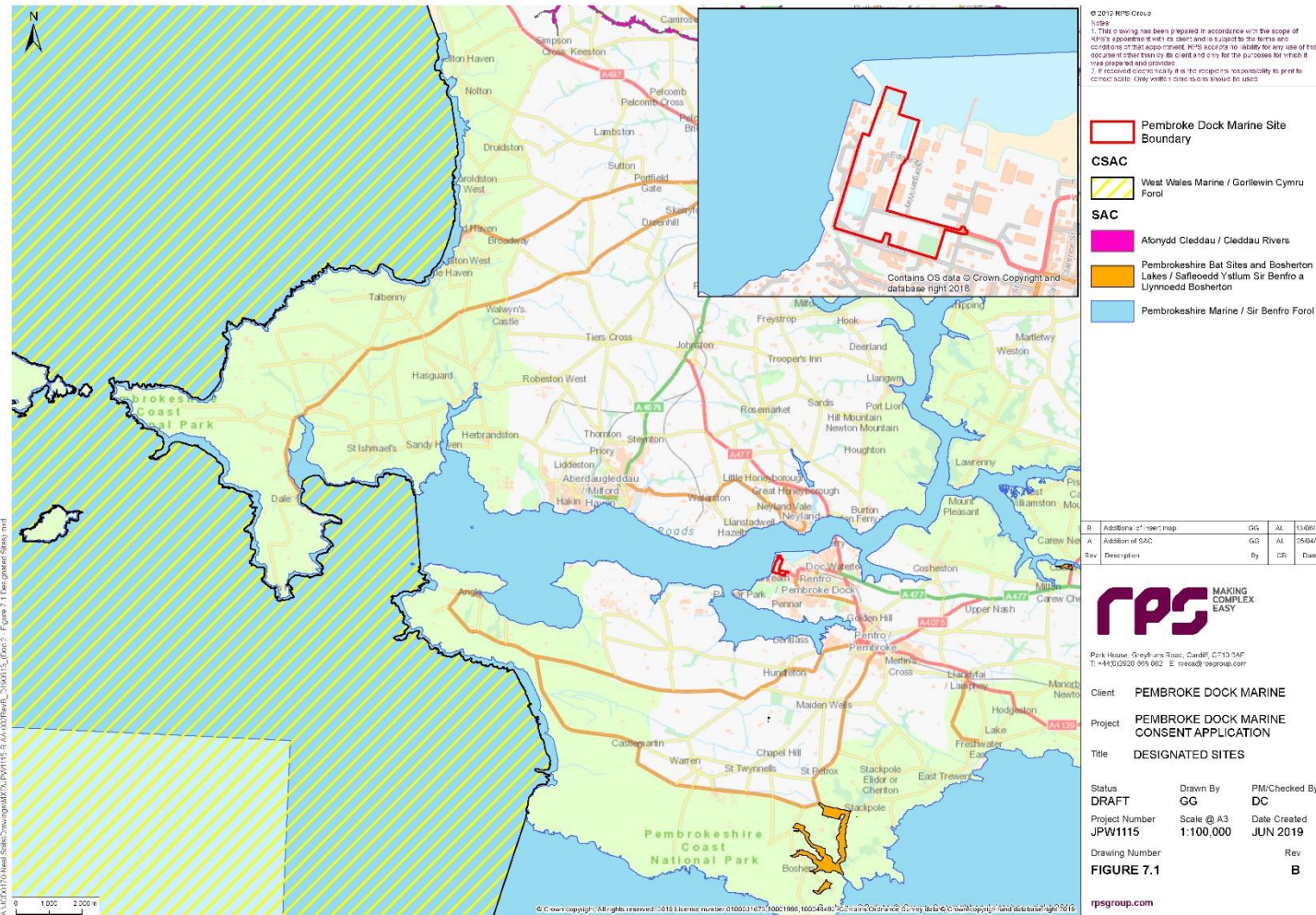
Figure 6.1: Designated sites identified within vicinity of the site.