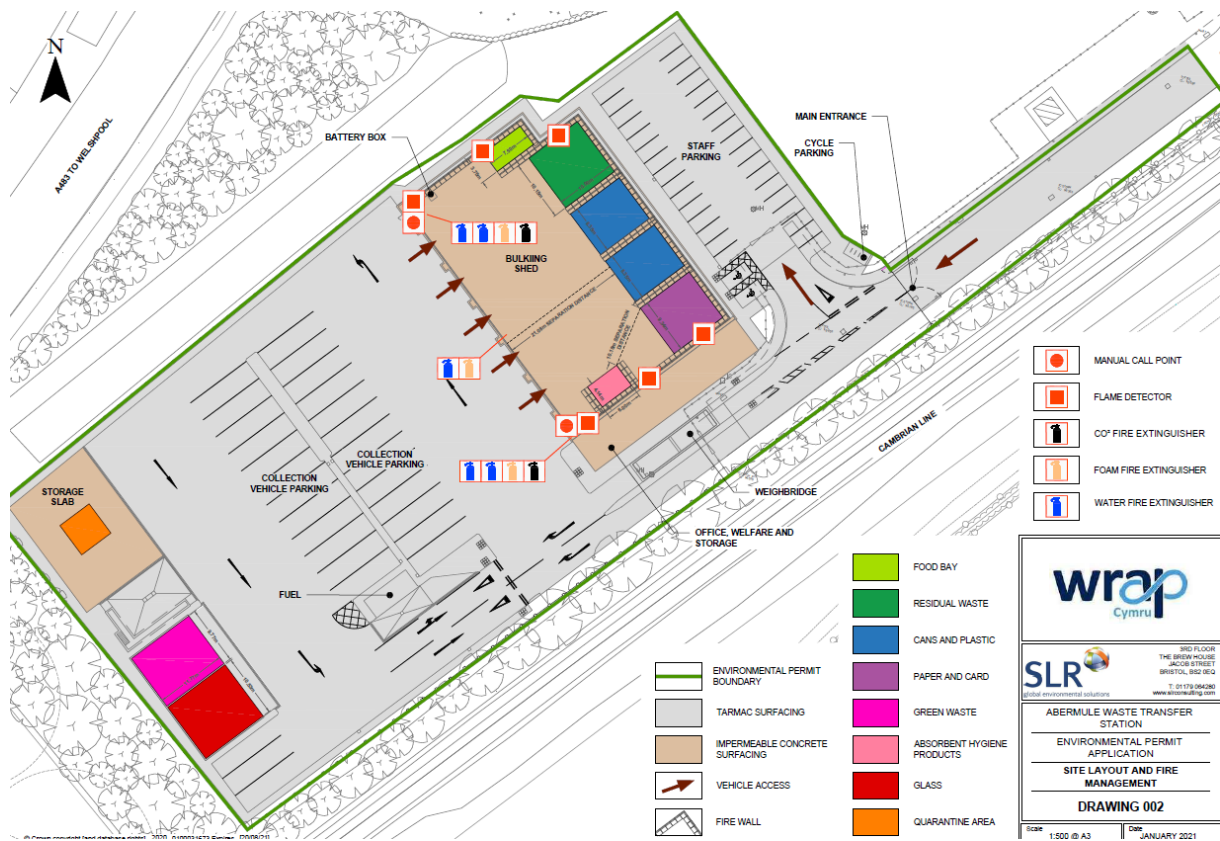
Figure 3-2: Plan of Bulking Facility