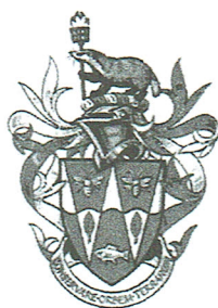
CIWM Chief Executive Officer

The Chartered Institution of Wastes Management