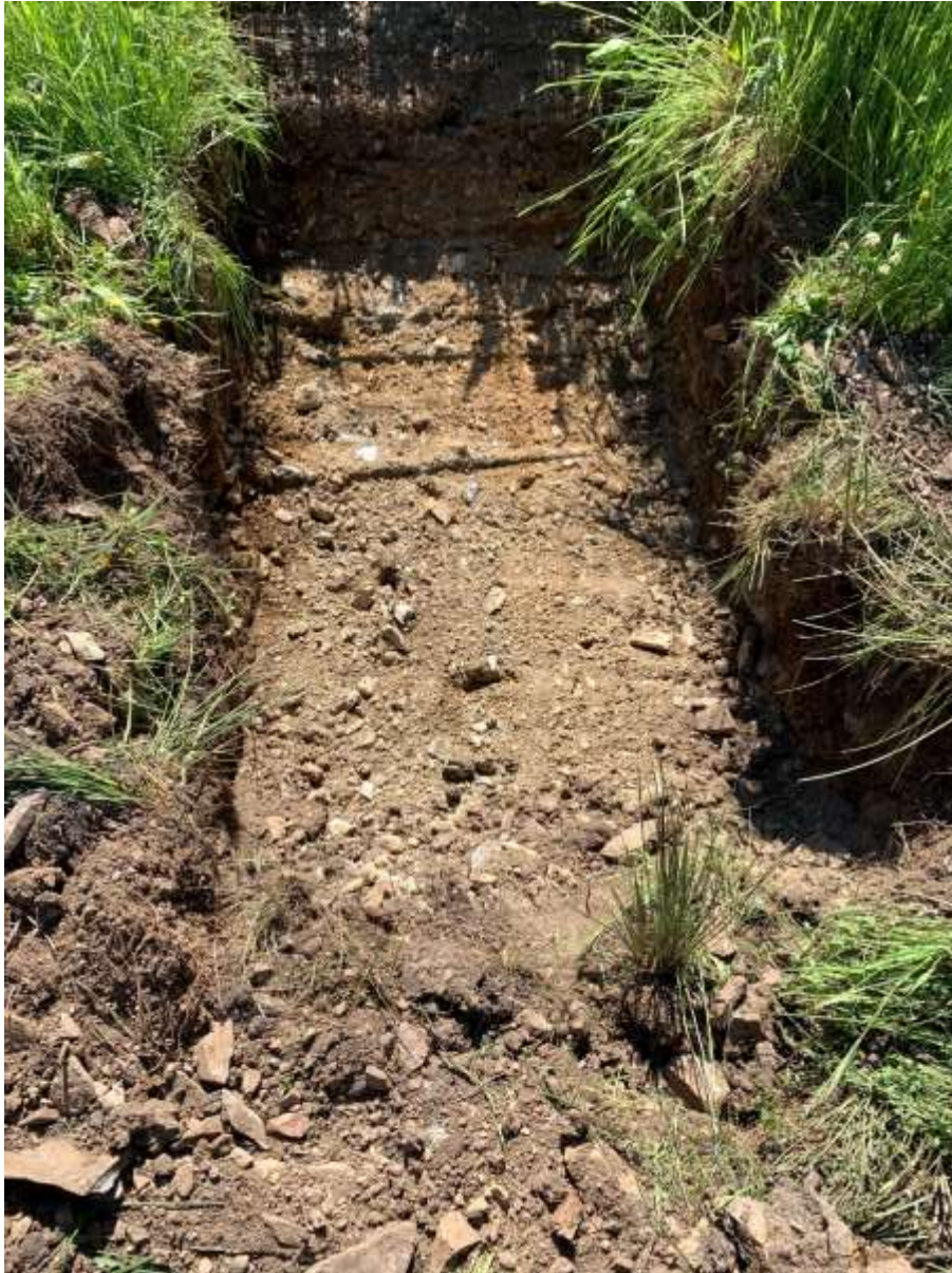
Hole 3 - Excavation failed