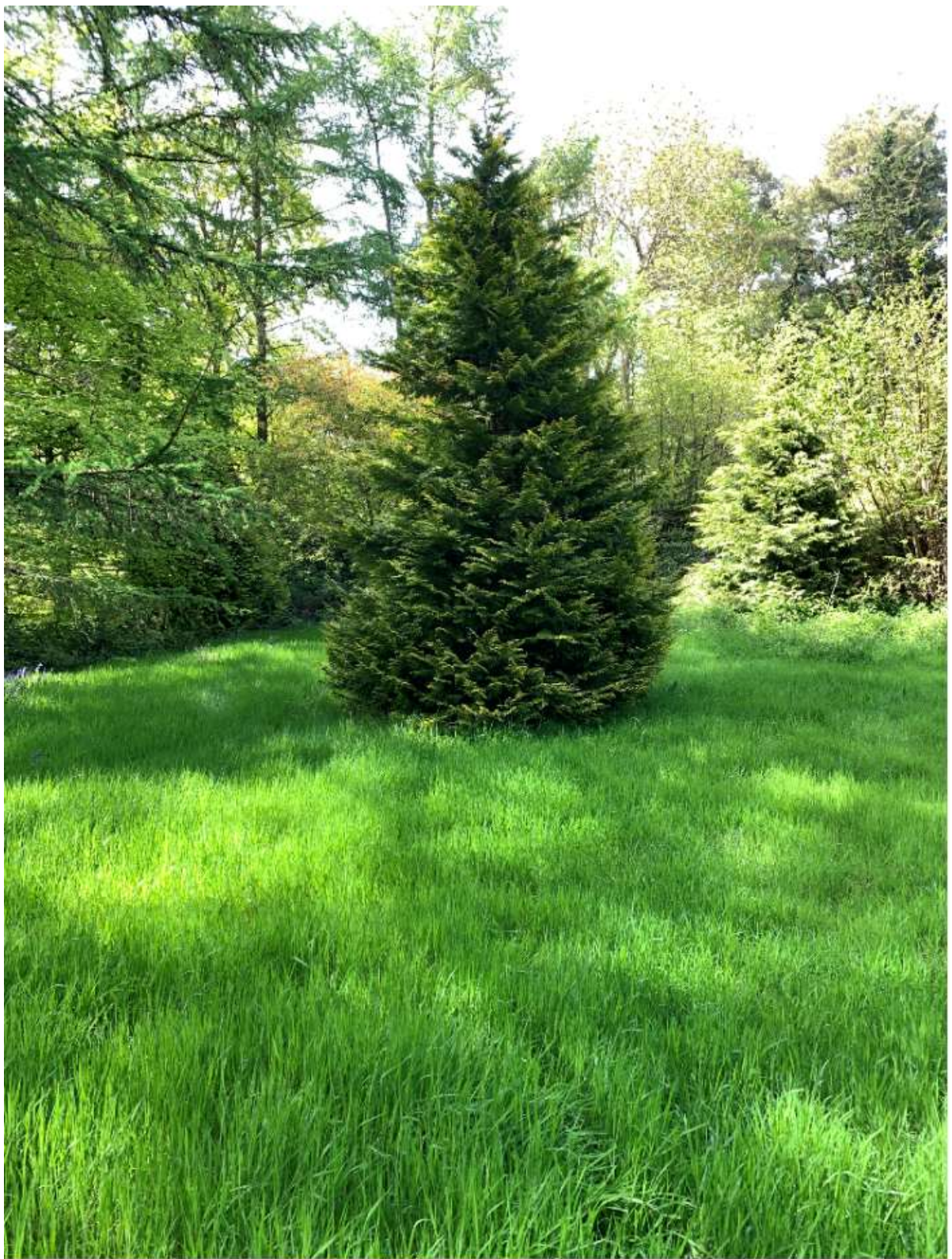
Filled ground level area