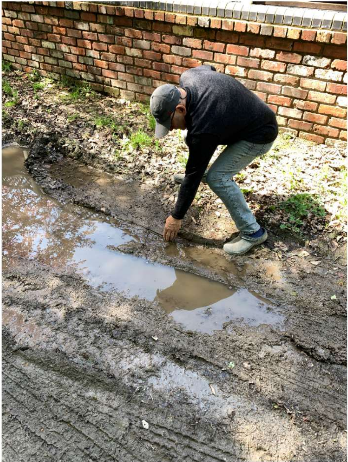
Location of manhole at entry to field drain from septic tank.