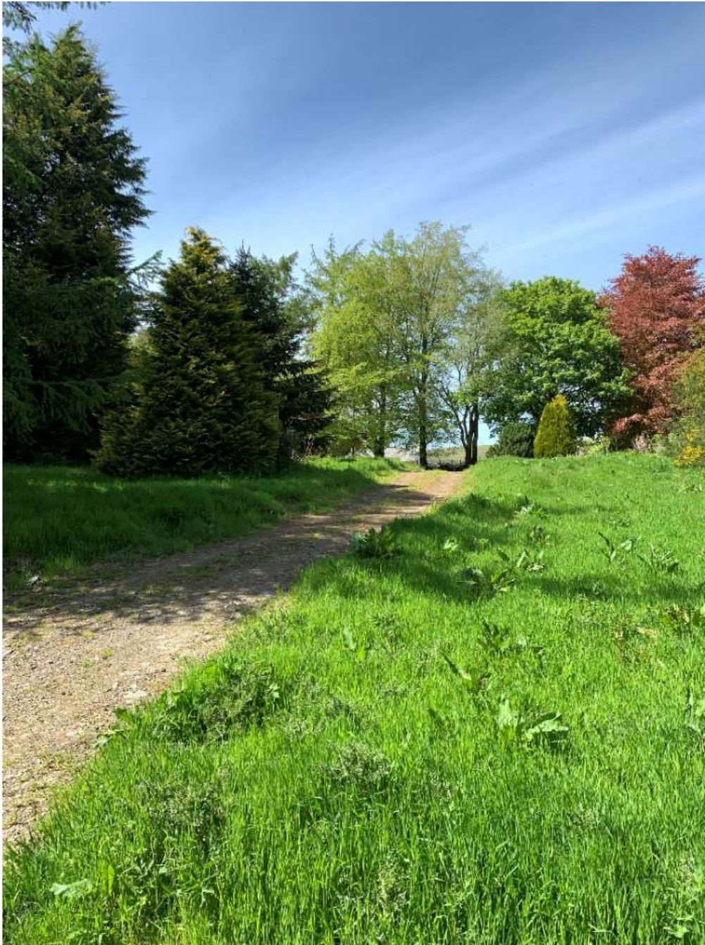
Area of filled ground looking from the south