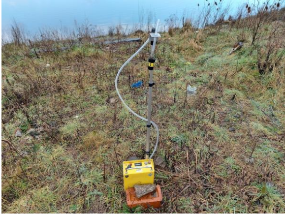
1. Sample 1, lagoon