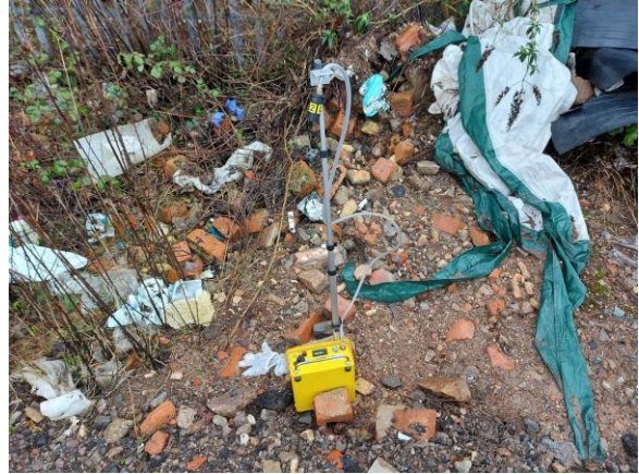
2. Sample 2, Scott Pallets