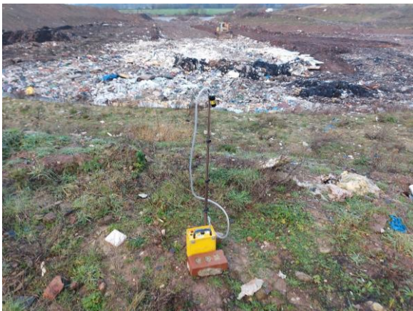
3. Sample 3, cell 5 ridge