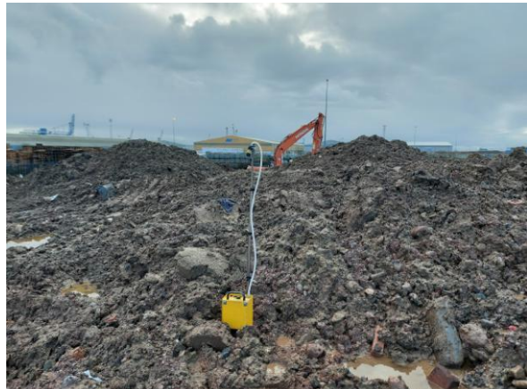
4. Sample 4, asbestos clay bund