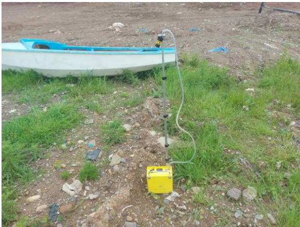
3. Sample 3, cell 3