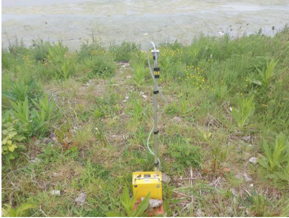
1. Sample 1, lagoon