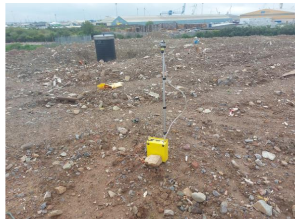
4. Sample 4, asbestos clay bund