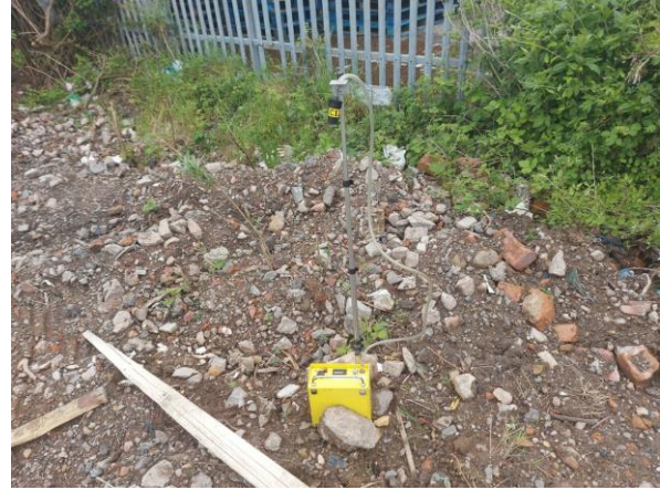
2. Sample 2, Scott Pallets