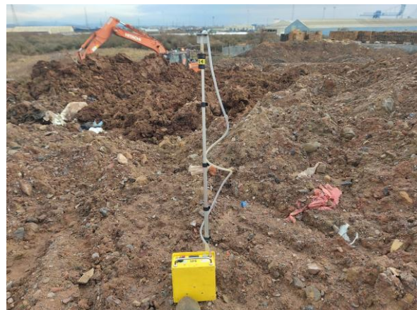
4. Sample 4, asbestos clay bund