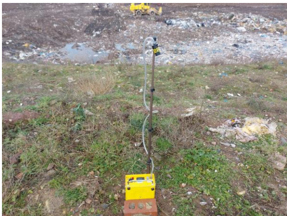
3. Sample 3, cell 5 ridge