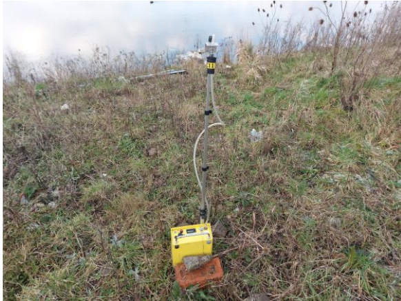
1. Sample 1, lagoon