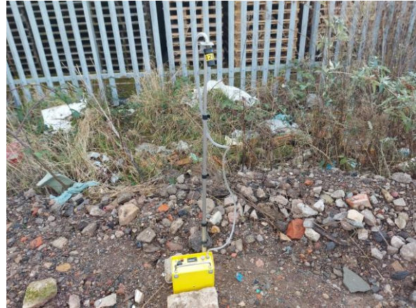
2. Sample 2, Scott Pallets